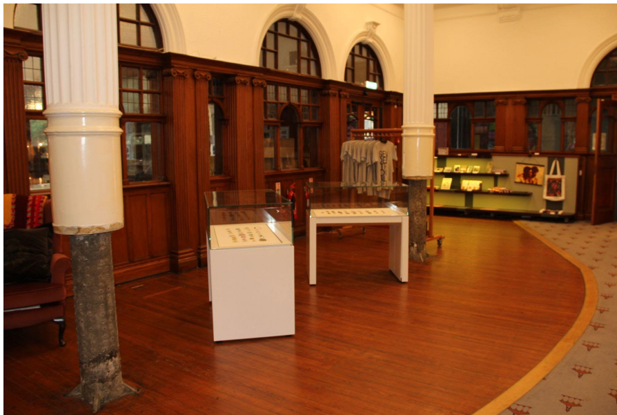
Our exhibition area in the lending library space