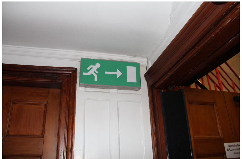
Emergency Exit Signs