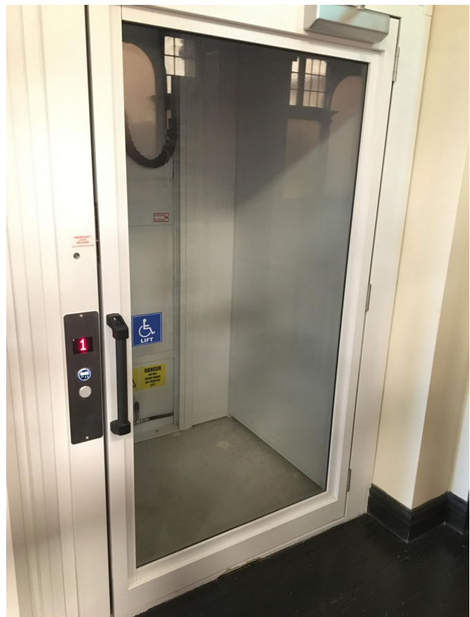
This is the lift to the mezzanine situated beside the staff kitchen.