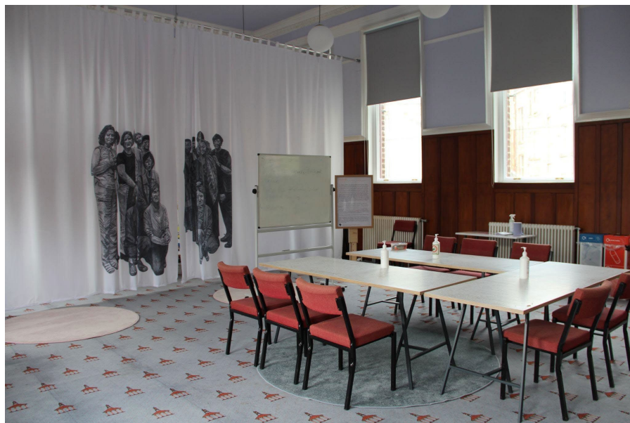
This is what the community room looks like

This room is used for classes or community events. You are welcome to sit in here if empty - please ask the person at front of house when you arrive if it is free.