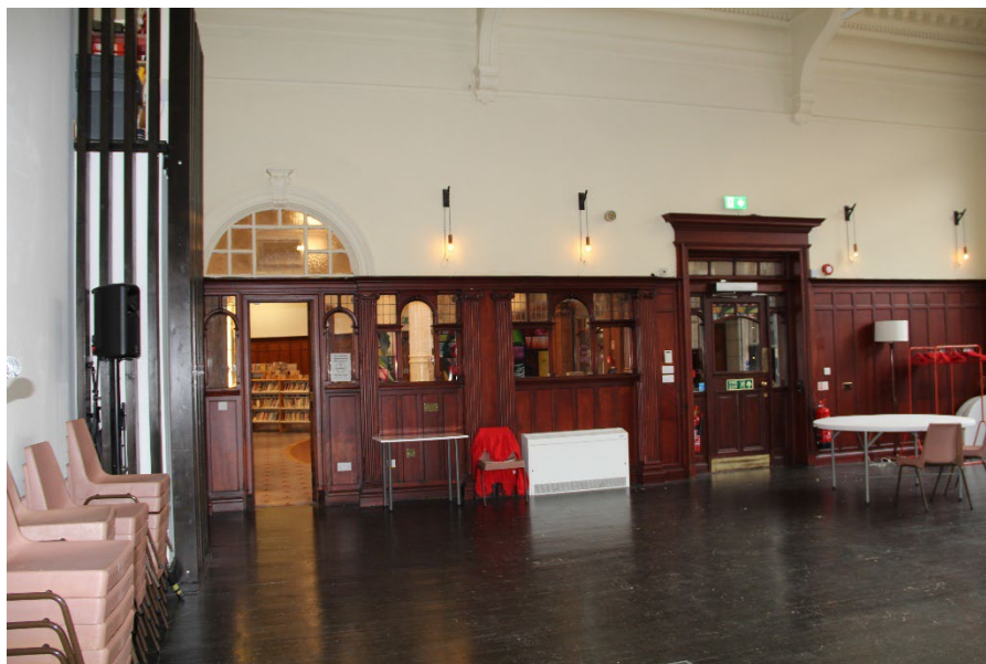
The events space looking towards the lending library space