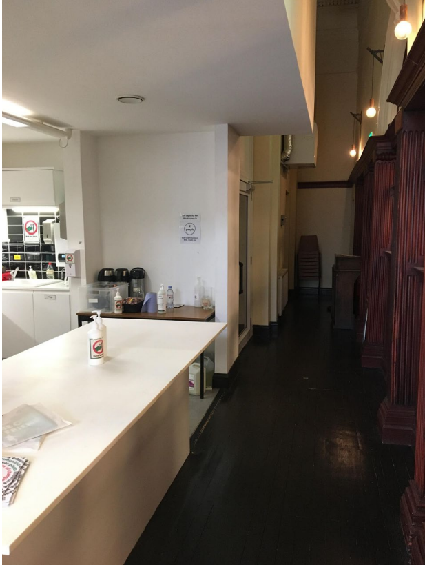
The corridor to your right as you enter the events space leads to the staff kitchen and the lift.