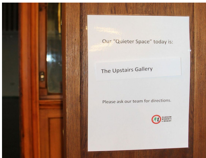
Daily Quiet Place Sign at Reception

You can find the designated quiet space for the day on the sign on reception at the front door.