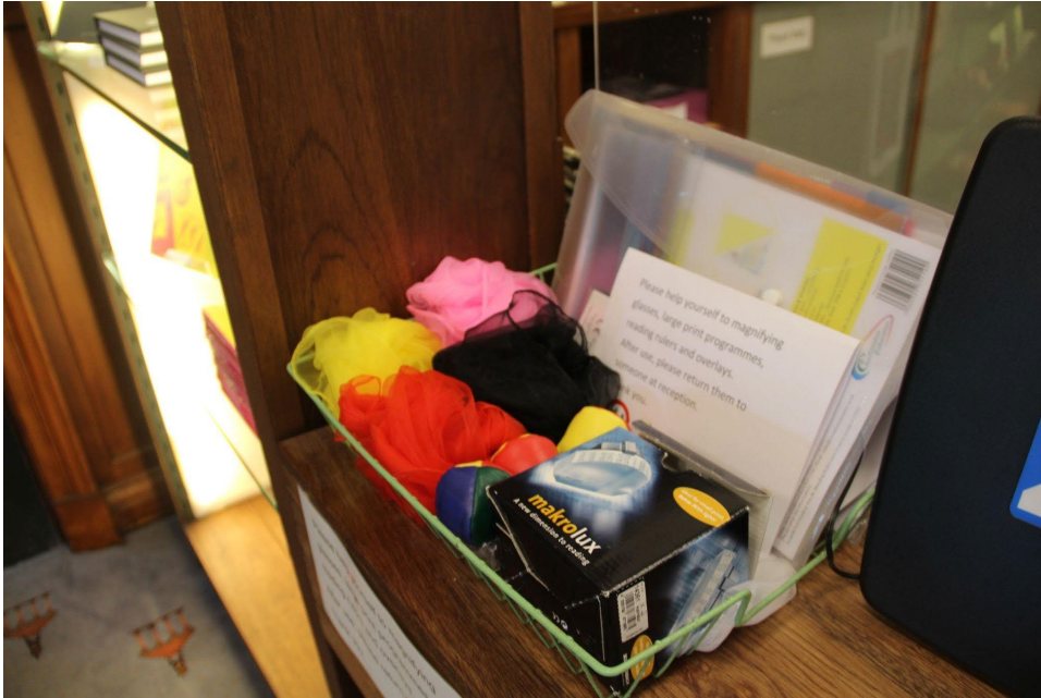
Stimming and visual aids tray at Front Desk

the event of a fire alarm please tell a member of staff on your arrival.