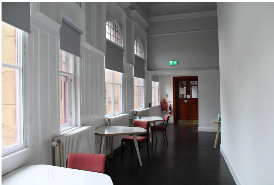
Exhibition and Seating Area. The wooden door in this picture leads to the community room.

There often is an exhibition in this room, although this will depend on when you come.