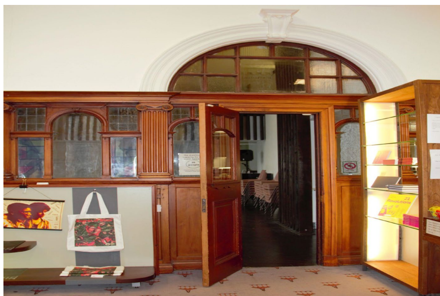
Door to the events space, on the left of front of house in the lending library space

To the left of the reception, you will find our Event space. Here we have an exhibition wall, a number of sitting areas you are welcome to use and the staff kitchen.