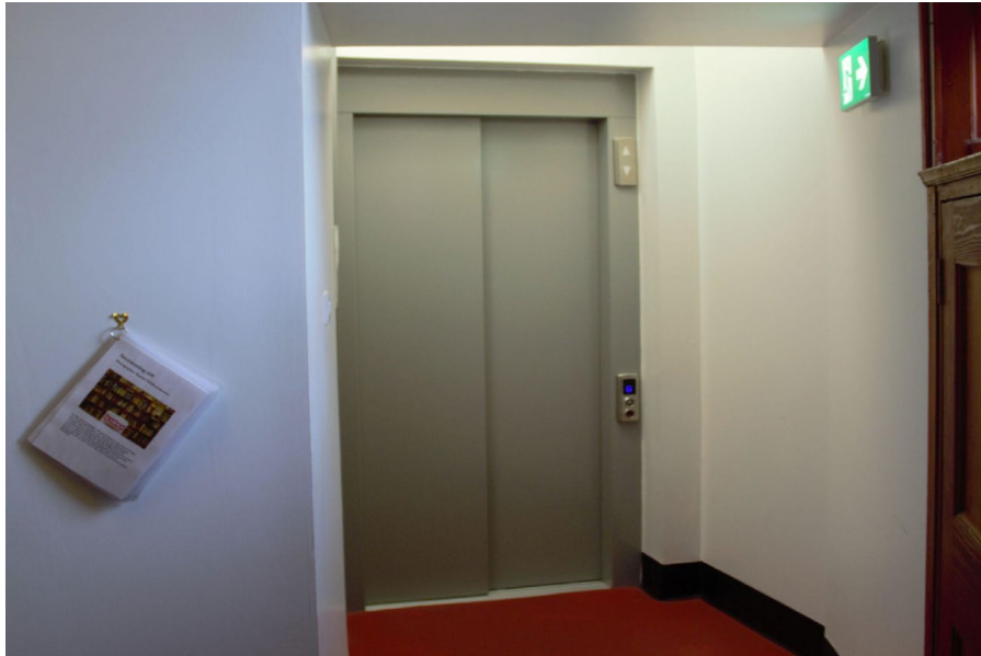
The lift to the Gallery is at the right-hand side of the stairs

If you climbed the stairs, you would have access to a hallway with two sets of doors - one for the community room, and one for the Gallery. If you took the lift, you would enter immediately into the Gallery.