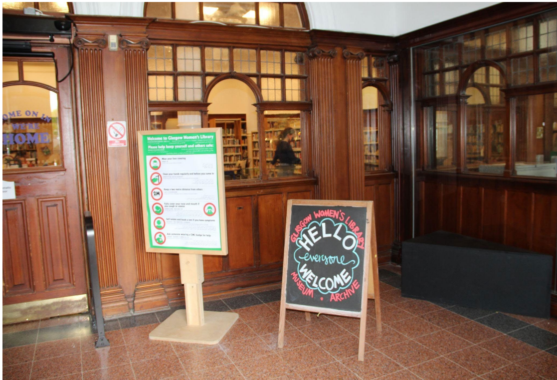
Our Foyer, with the 'Welcome Wall' and display area on the right when you arrive