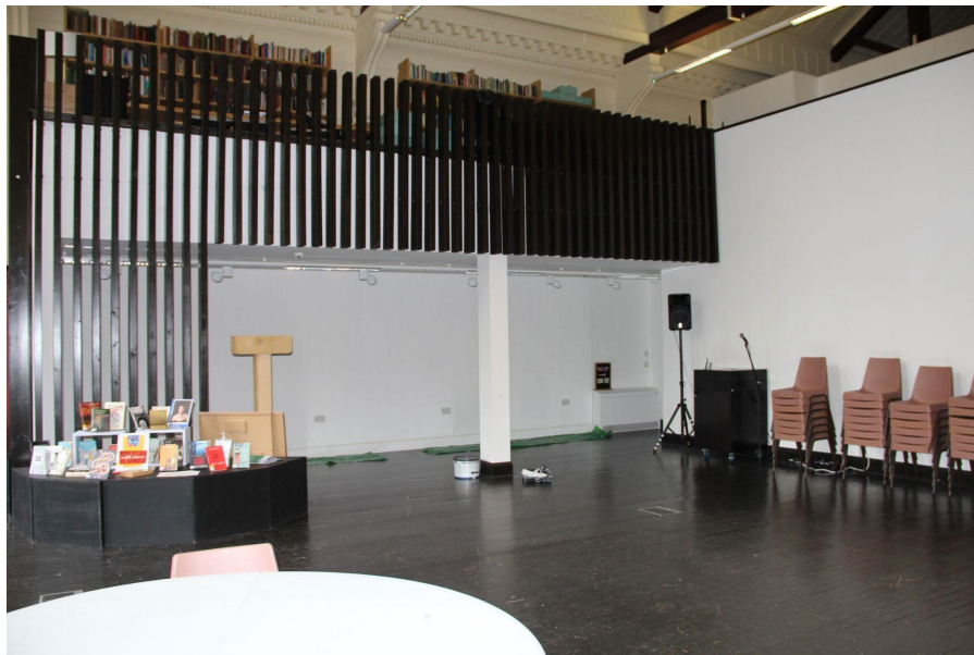
The events space with the exhibition wall under the mezzanine