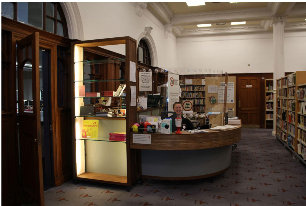
Our front of house desk

This is what our shop and reception look like, this is also where you will find stimulating materials, a quiet space sign, and a member of staff who can help you. You are welcome to come say hello and ask any questions!