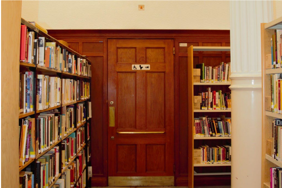
One of our accessible Toilets within the building

There is a disabled bathroom passed the reception area on the far-away wall of the lending library.