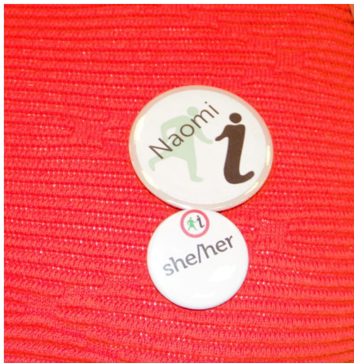
Employee or volunteer's name and pronouns badges.

If you are lost, or in need of any assistance, please don't hesitate to ask a member of staff or a volunteer. You can tell us apart from the public through these badges