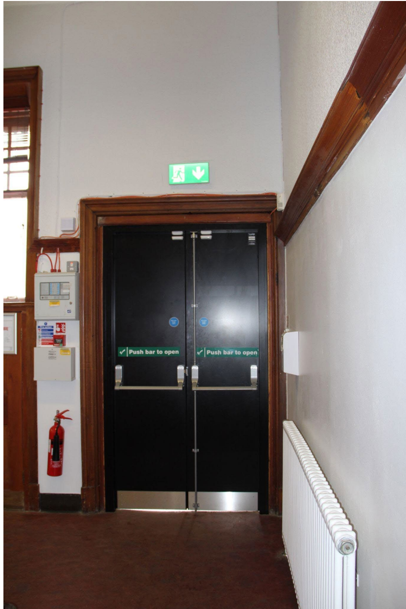
The door for emergency exits

In the case of an emergency, you may be escorted out of our side door. If you are unsure, please ask a member of staff.