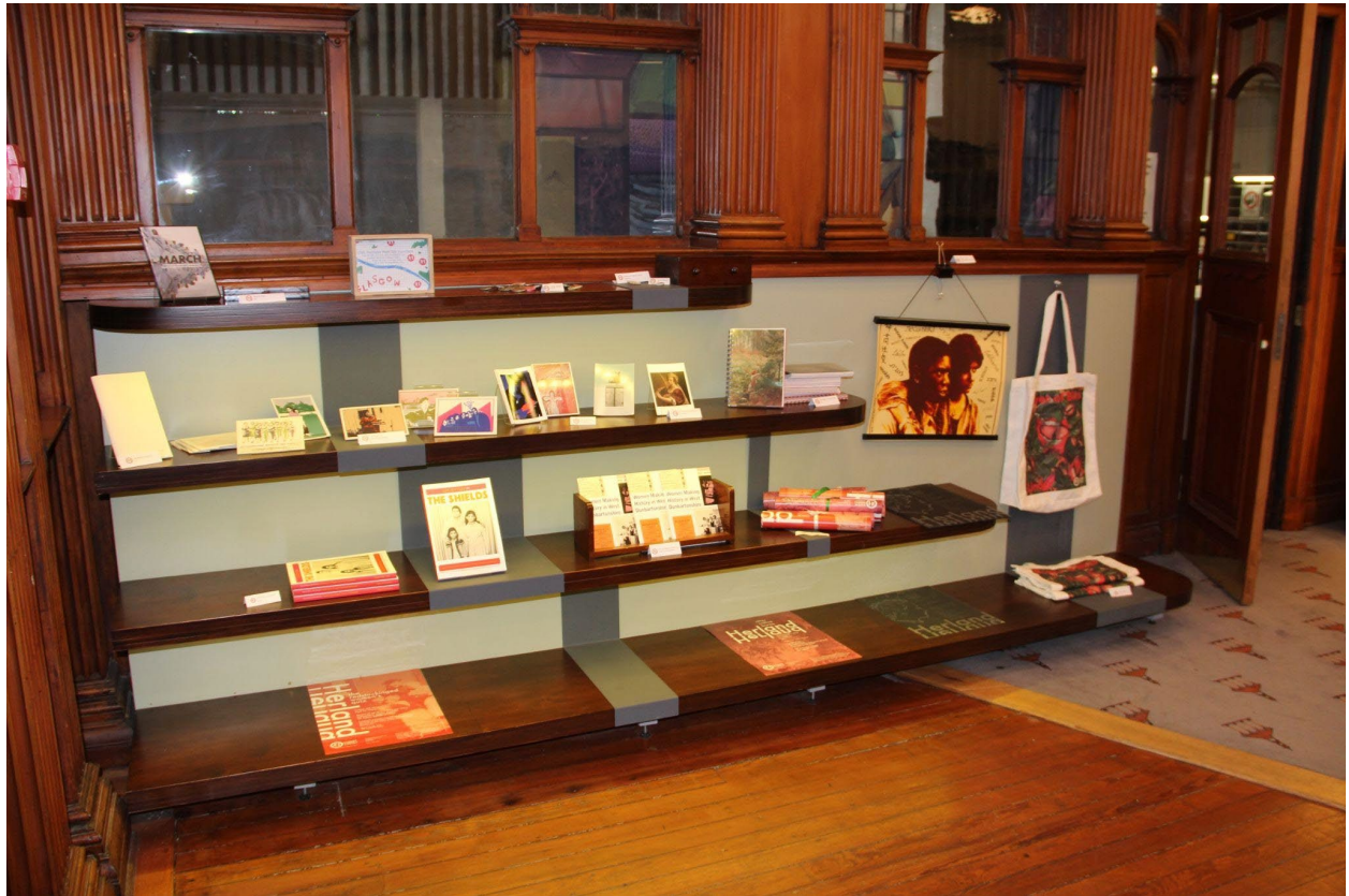
Our Shop, which is to your left as you enter the library