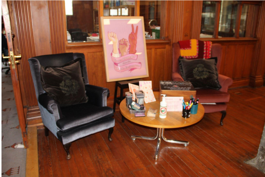
One of our areas for relaxing and reading

At the front end of the library, we have an area for relaxing and a small exhibition space. You are welcome to explore this area!