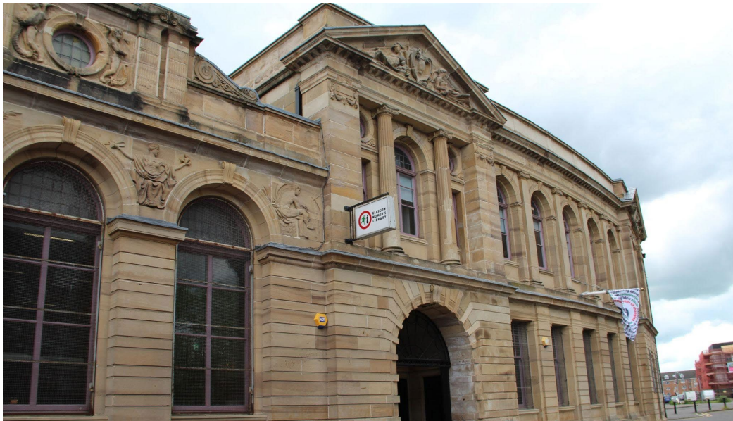
This is what the front of the building looks like

You enter the building on the ground floor, there are two floors in the building.