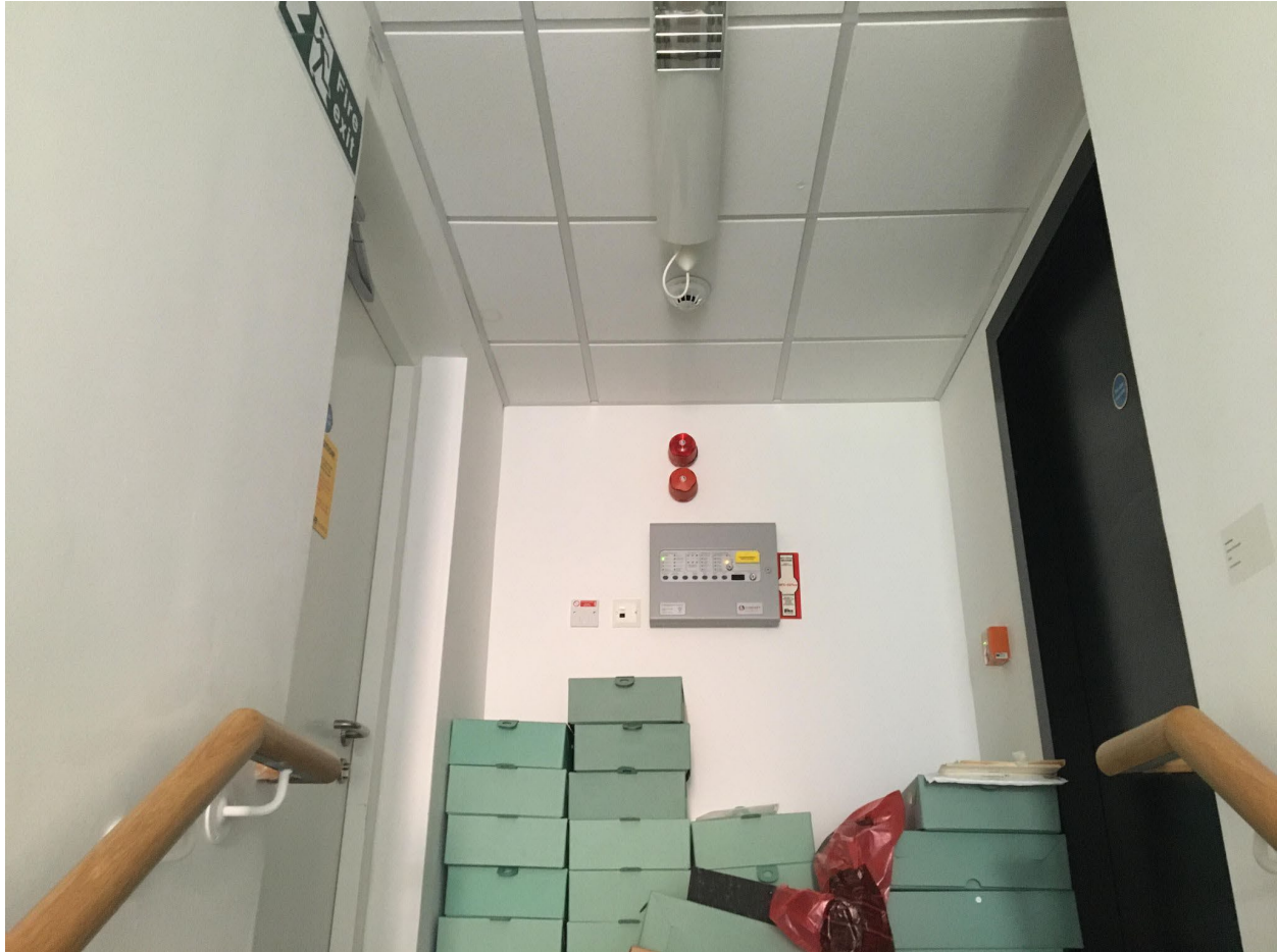
The two doors at the top of the stairs, one to the archive store and one to the mezzanine space

At the top of the stairs there are two doors – the one on right leads into the mezzanine space and the one on the left is to one of the archive stores.