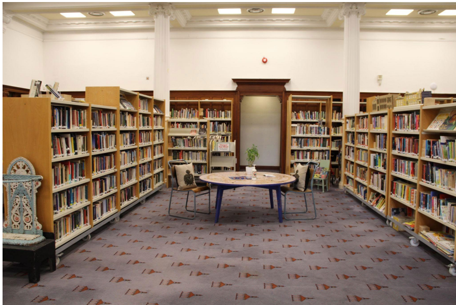
Our Lending Library

The lending library is one of the largest rooms we have at GWL, moving to the right of the reception area here is where the books are stored, and we have a number of areas to sit and work or enjoy the collection. You are welcome to explore and read the books in our library.