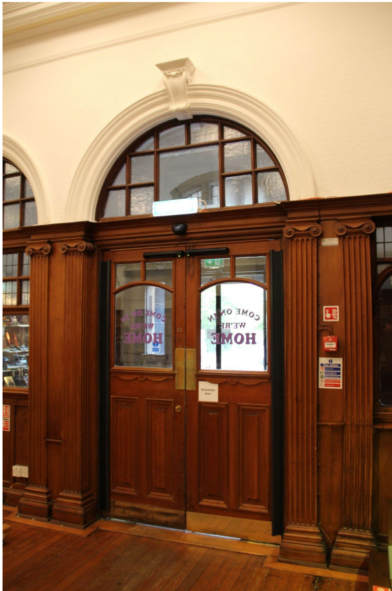
The door to exit GWL

You will exit the building in the same place that you entered.