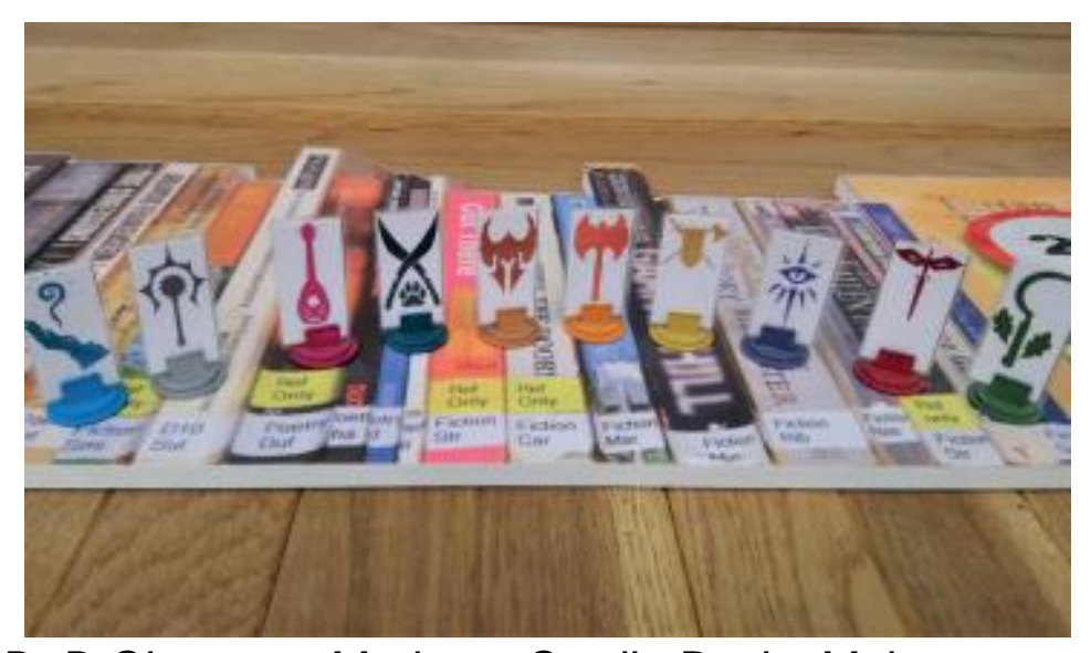
GWL DnD Character Markers.

Characters and resources are provided for the beginner-friendly game, and each plays the same adventure, so pick the best date for you. Bring your own character for the advanced game.