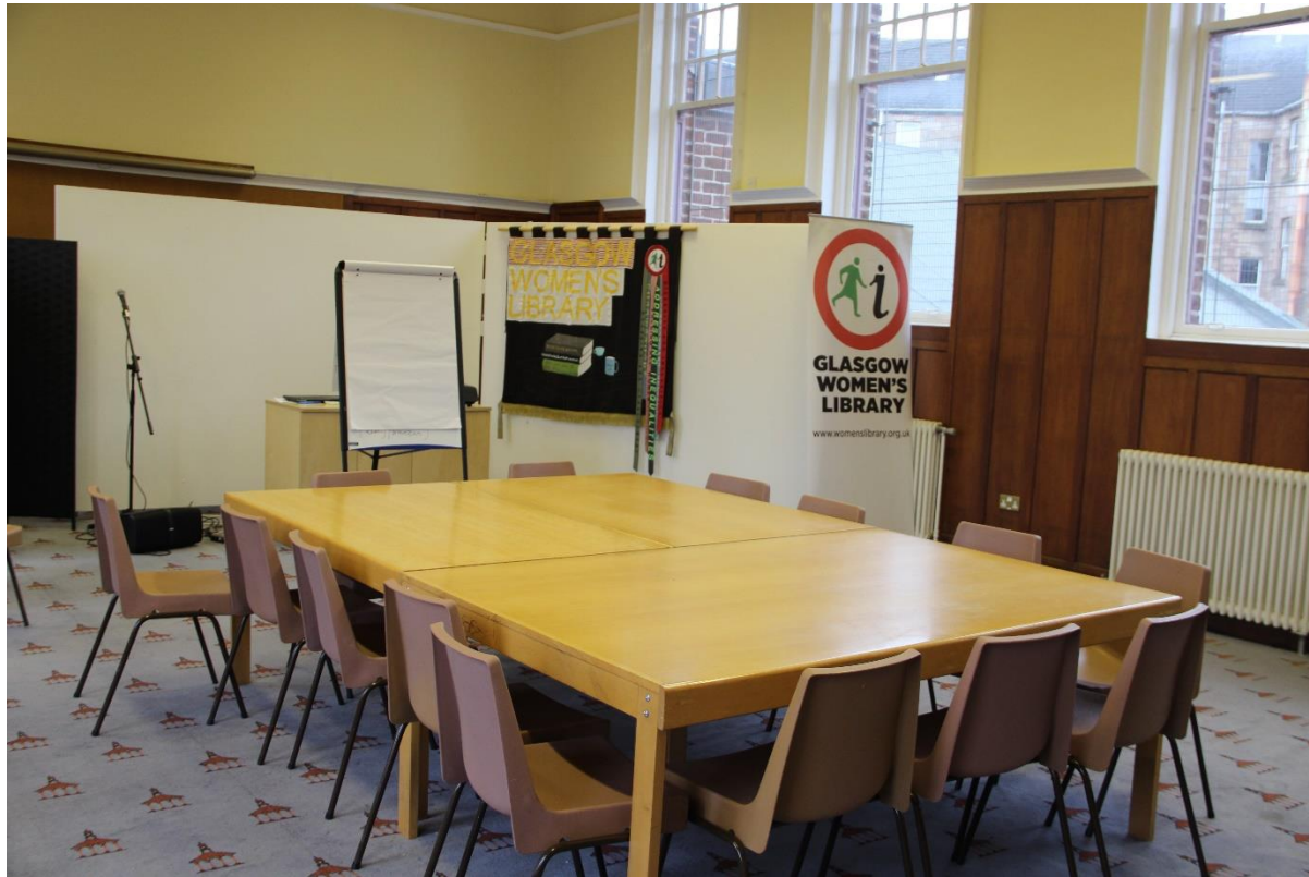
The Community Room – Screening Space

The Community Room is where the screening is taking place. The chairs are cushioned and will be laid out in rows. The room has fluorescent lighting which will be turned off during the screening.