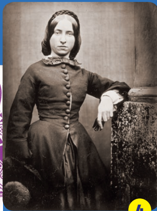
Harpies & Quines Cover, GWL Collections. Madeleine Smith, Mitchell Library. Margaret Macdonald Mackintosh, James Craig Annan.