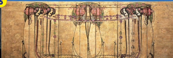
The May Queen by Margaret Macdonald, Glasgow Museums. Temperance Coin, Glasgow Museums. Carrie A Nation, Glasgow Museums.