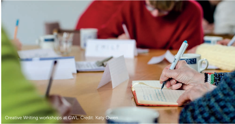
Creative Writing workshops at GWL.