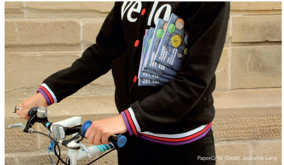
PaperGrrls.

For more information or to book onto any of these events contact the Library on 0141 550 2267 , email us at info@womenslibrary.org.uk or visit womenslibrary.org.uk