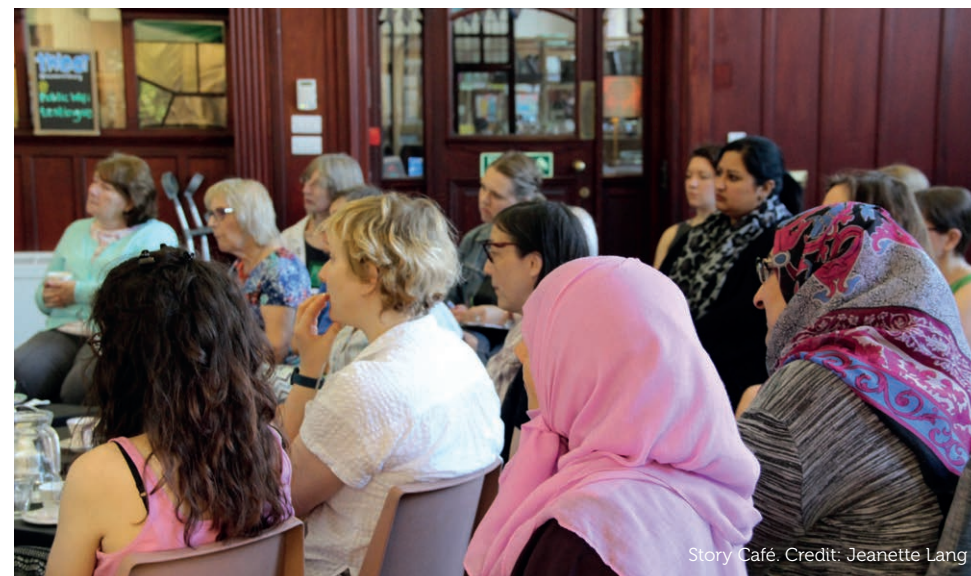
Story Café.