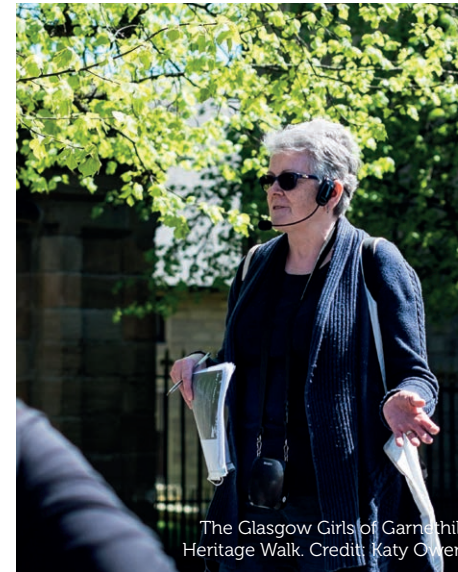
The Glasgow Girls of Garnethill Heritage Walk.

"THE GUIDES WERE GREAT: SO FRIENDLY, HELPFUL AND CONSIDERATE AS WELL AS KNOWLEDGEABLE AND INTERESTING TO LISTEN TO."