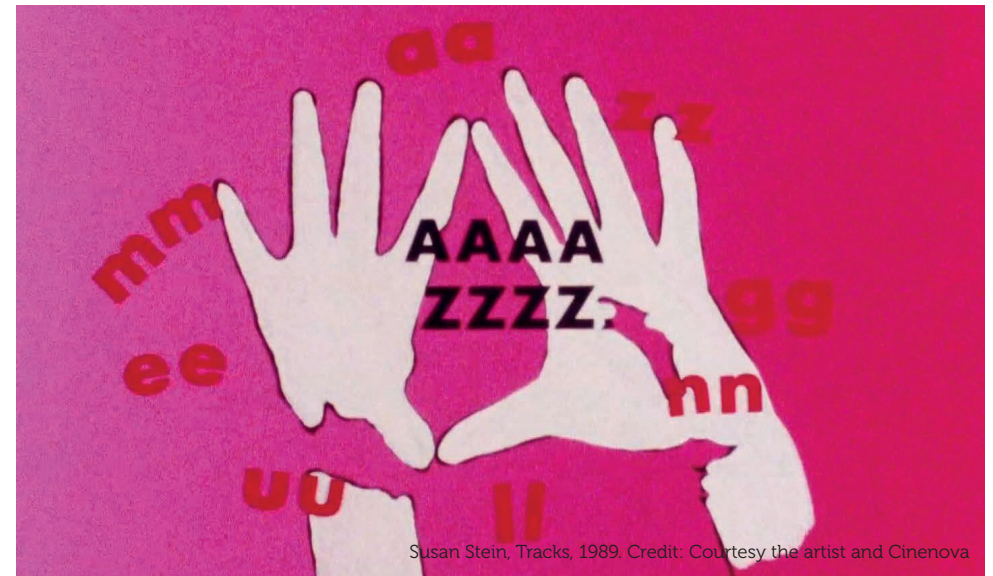
Susan Stein, Tracks, 1989.