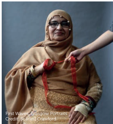
First Waves: Glasgow Portraits. Credit: Scarlett Crawford