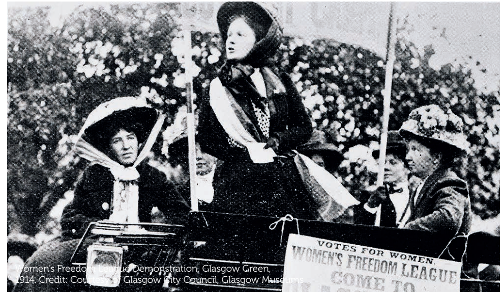
Women's Freedom League Demonstration, Glasgow Green, 1914.

Women are under-represented in all levels of Scottish politics. The Parliament Project encourages women to run for political office by demystifying the process. This workshop will explore how women can best prepare for this role and the stages involved in getting elected; from becoming an activist and joining a party, through to selection and election.