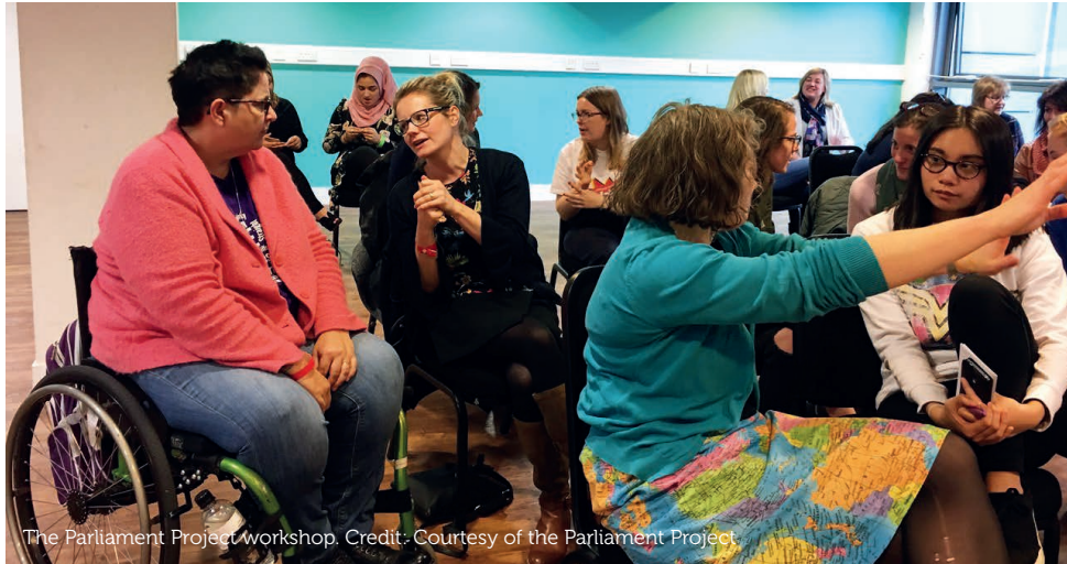
The Parliament Project workshop.