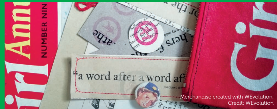
Merchandise created with WEvolution.

The staff and Board, and hundreds of our visitors, audiences, volunteers, Friends, and supporters got behind our bid to bag Museum of the Year. Although our case was a compelling one, we have had to settle for making our mark as Finalists and being the first equalities focussed resource to do so. You can read more about our campaign on our website and look out for our specially designed tote bags that mark this milestone.