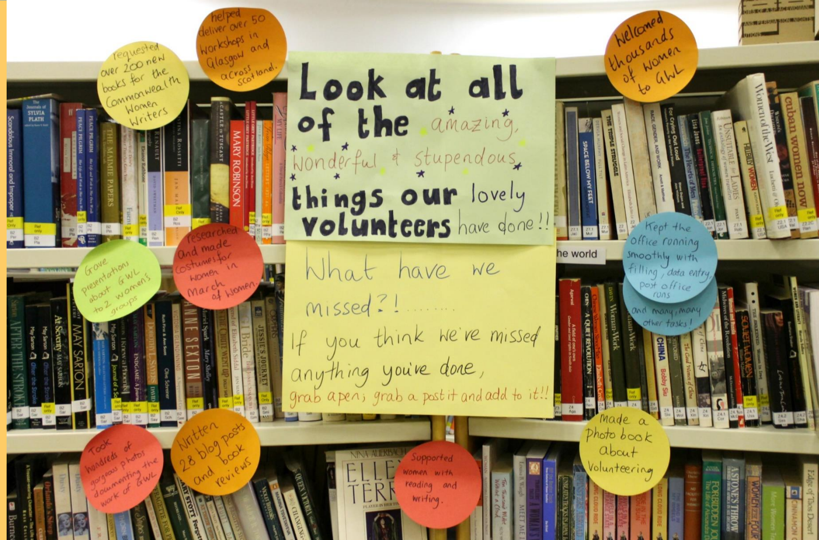
Volunteers' Week celebration, 2016

“The best thing is being able to realise your own ideas and participate in all aspects of GWL.”