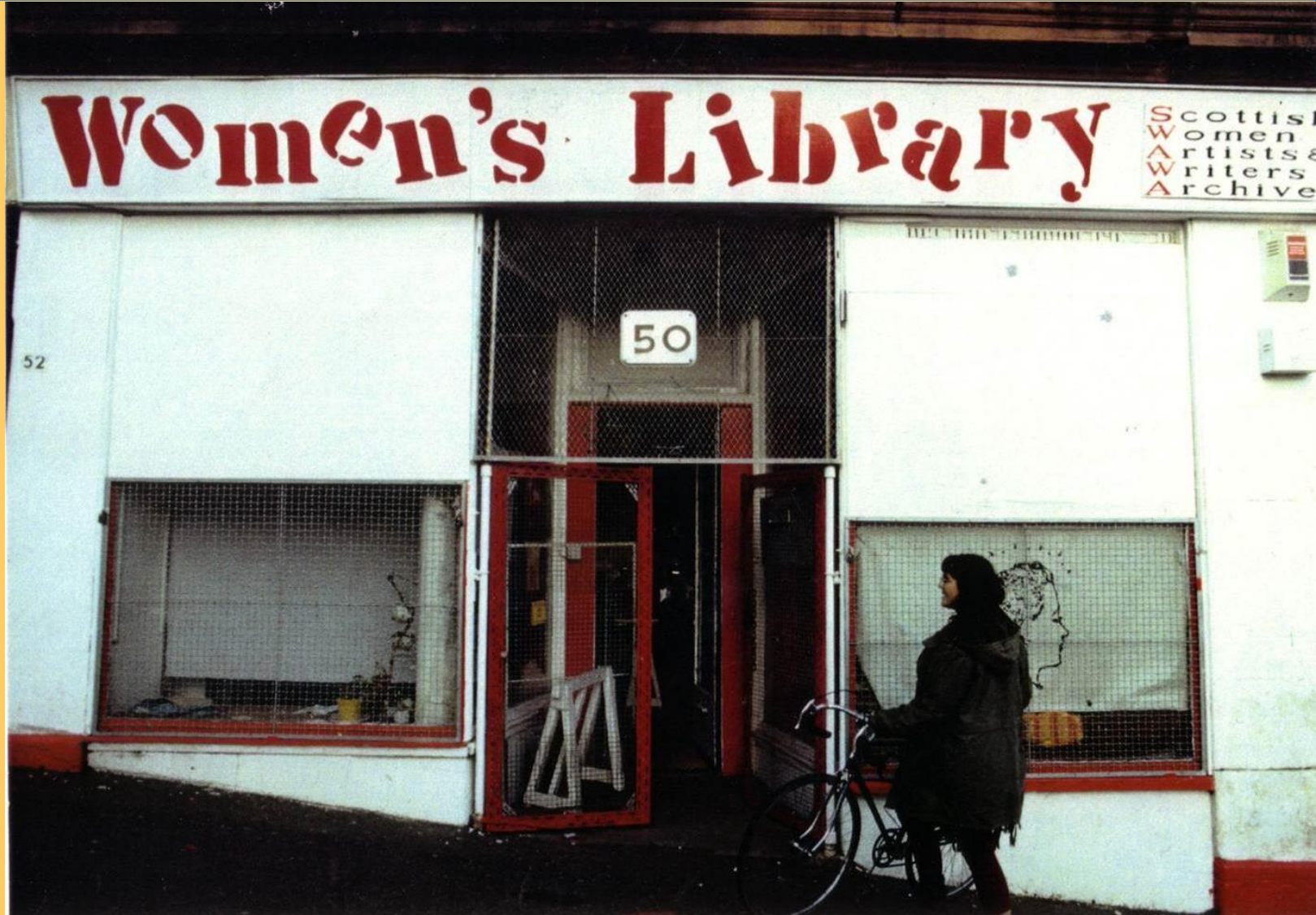
Glasgow Women's Library, circa 1991, Garnethill, Glasgow