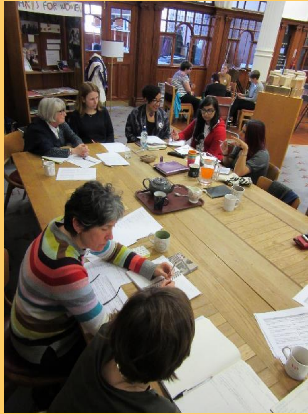
Developing the current Equality, Diversity and Inclusion Action Plan. 25 staff, board and volunteers were involved in this process.