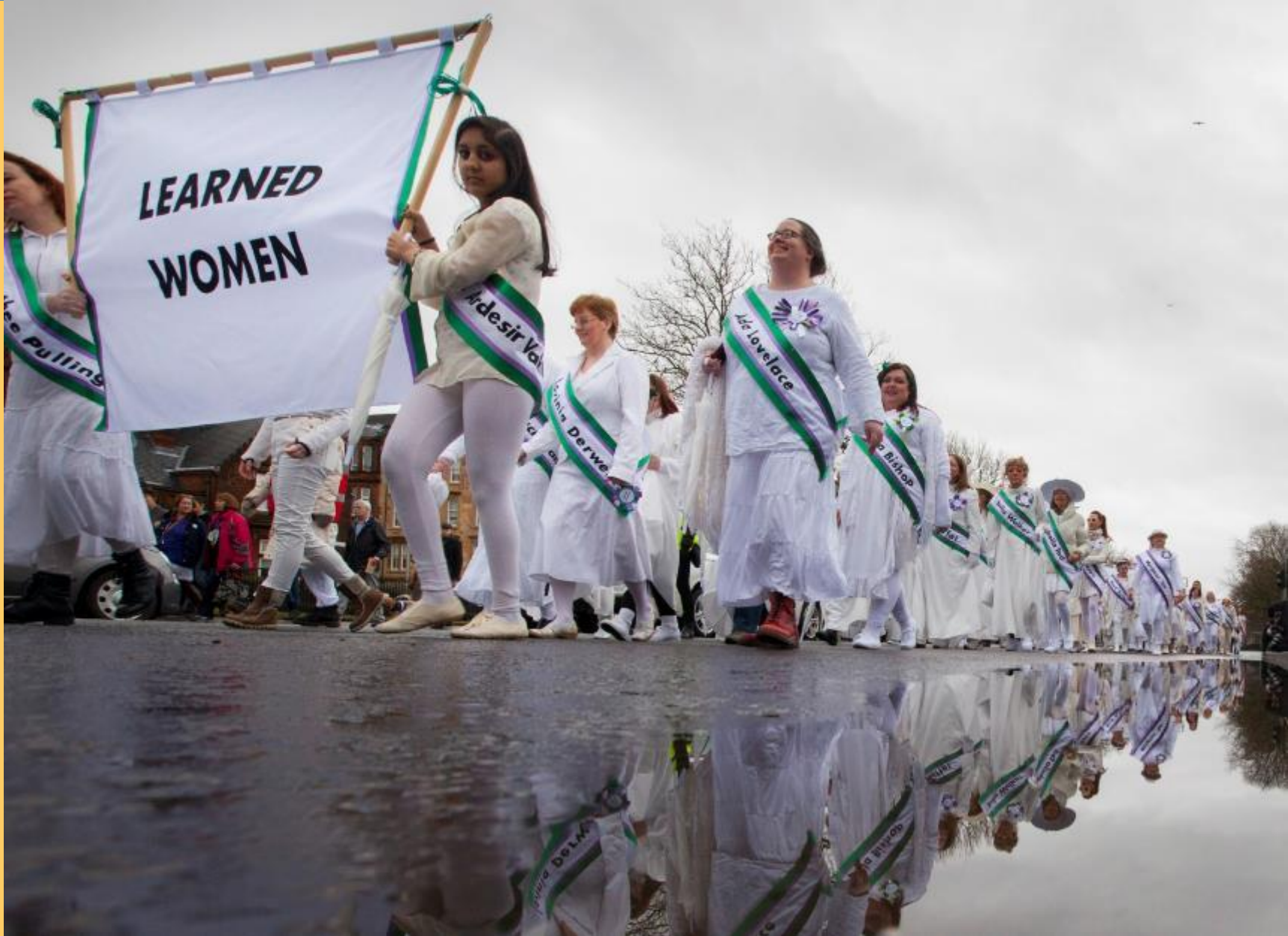
March of Women, a collaboration between GWL and the Royal Conservatoire of Scotland.