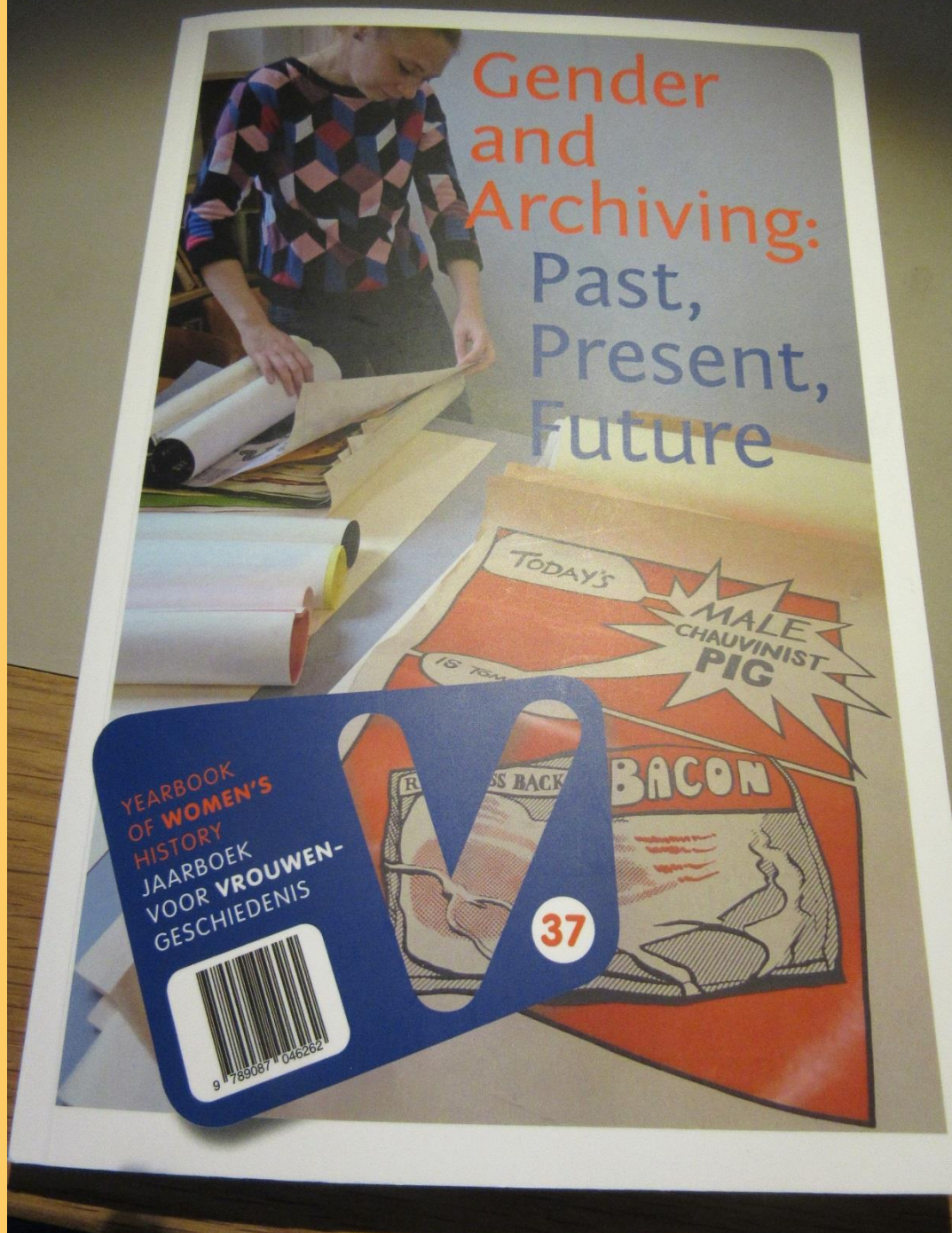
Glasgow Women's Library feature on the cover and their work profiled in a chapter of the International Women's History Yearbook , 2017