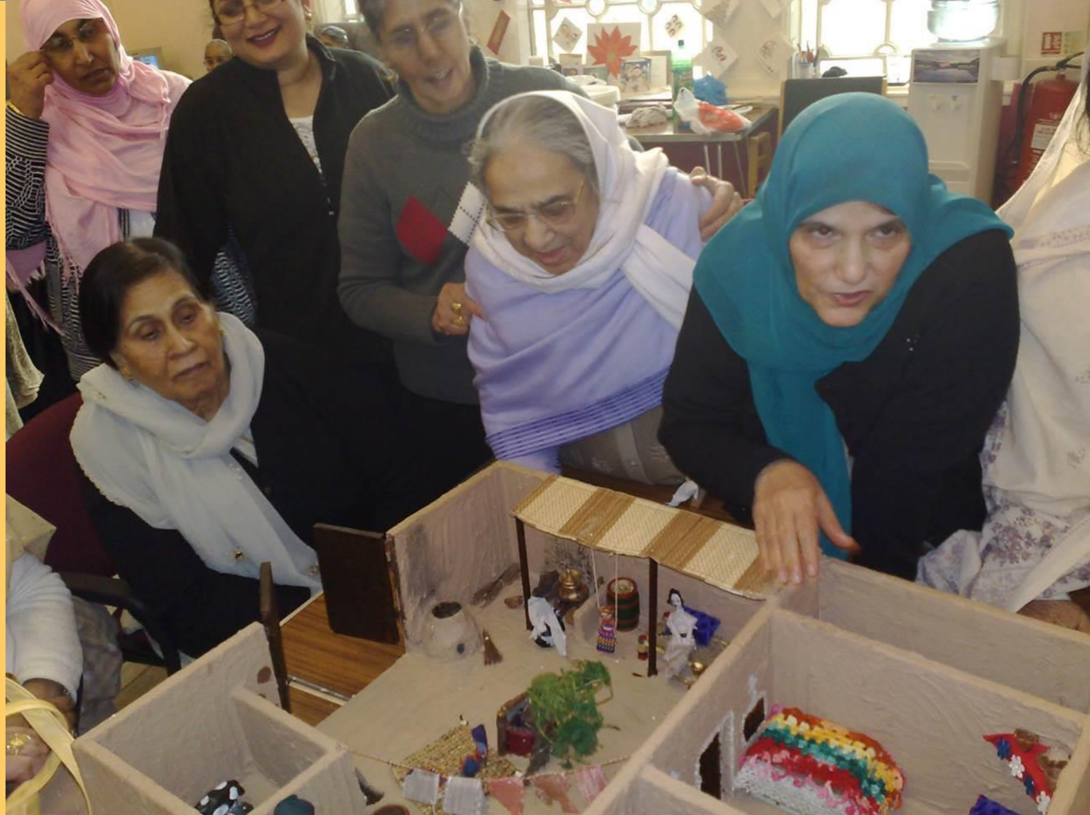
GWL Community curators collaborating on She Settles in the Shields ; untold stories of migrant women in Pollokshields project (2012)