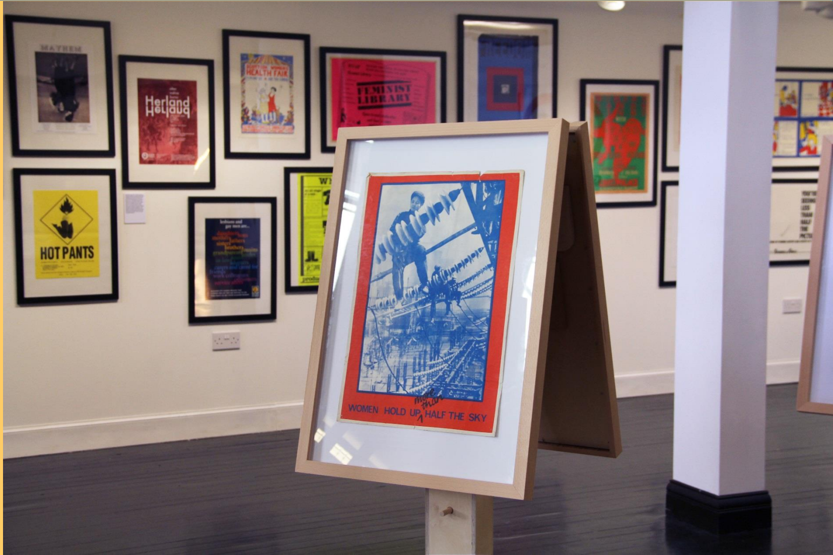
Sisterhood is Powerful , poster exhibition curated by GWL Designer in Residence, Kirsty McBride, 2017