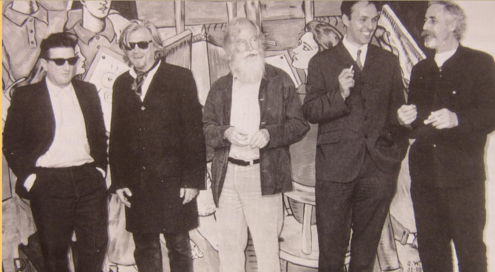
The New Glasgow Boys