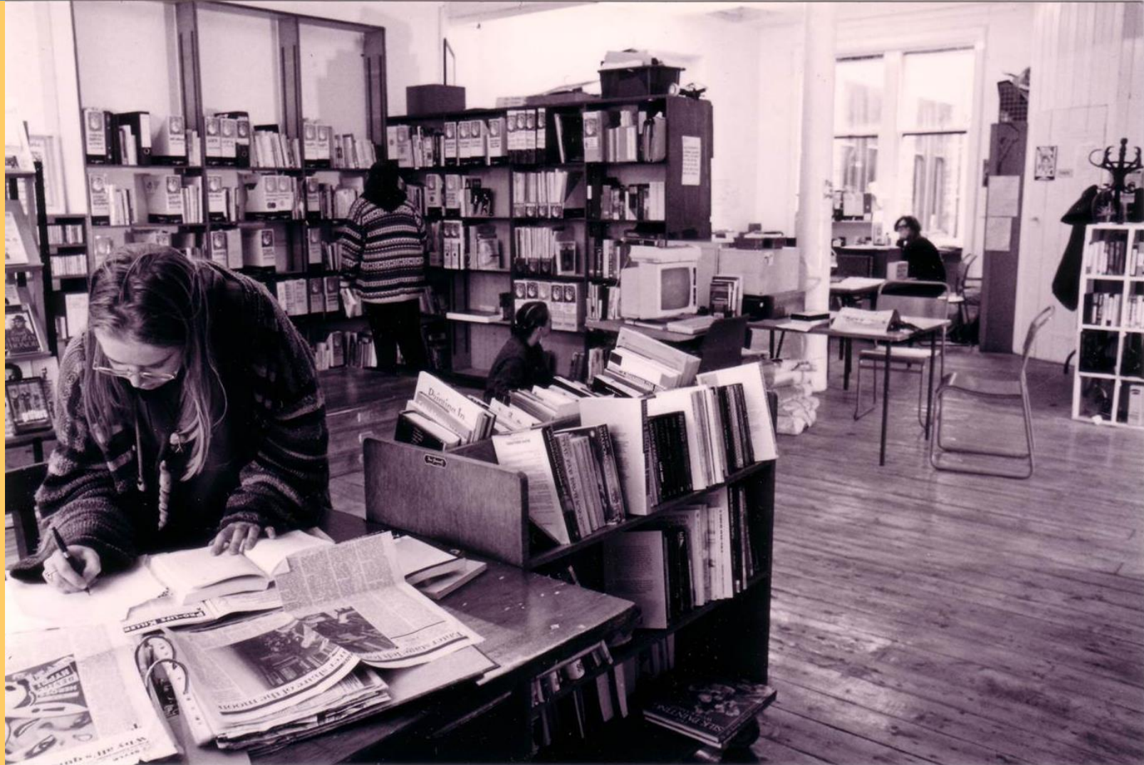
Glasgow Women's Library, Trongate premises, circa 1993