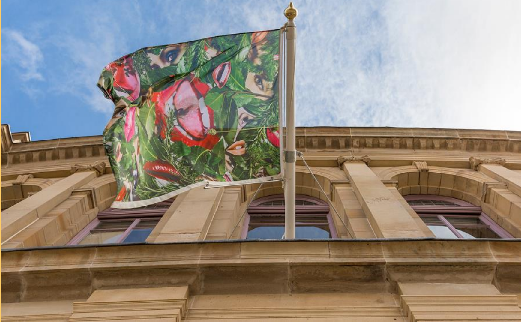
Bower of Bliss , Linder, a commissioned flag and film with accompanying exhibition for Glasgow Women's Library, Glasgow International Festival of Visual Art, 2018