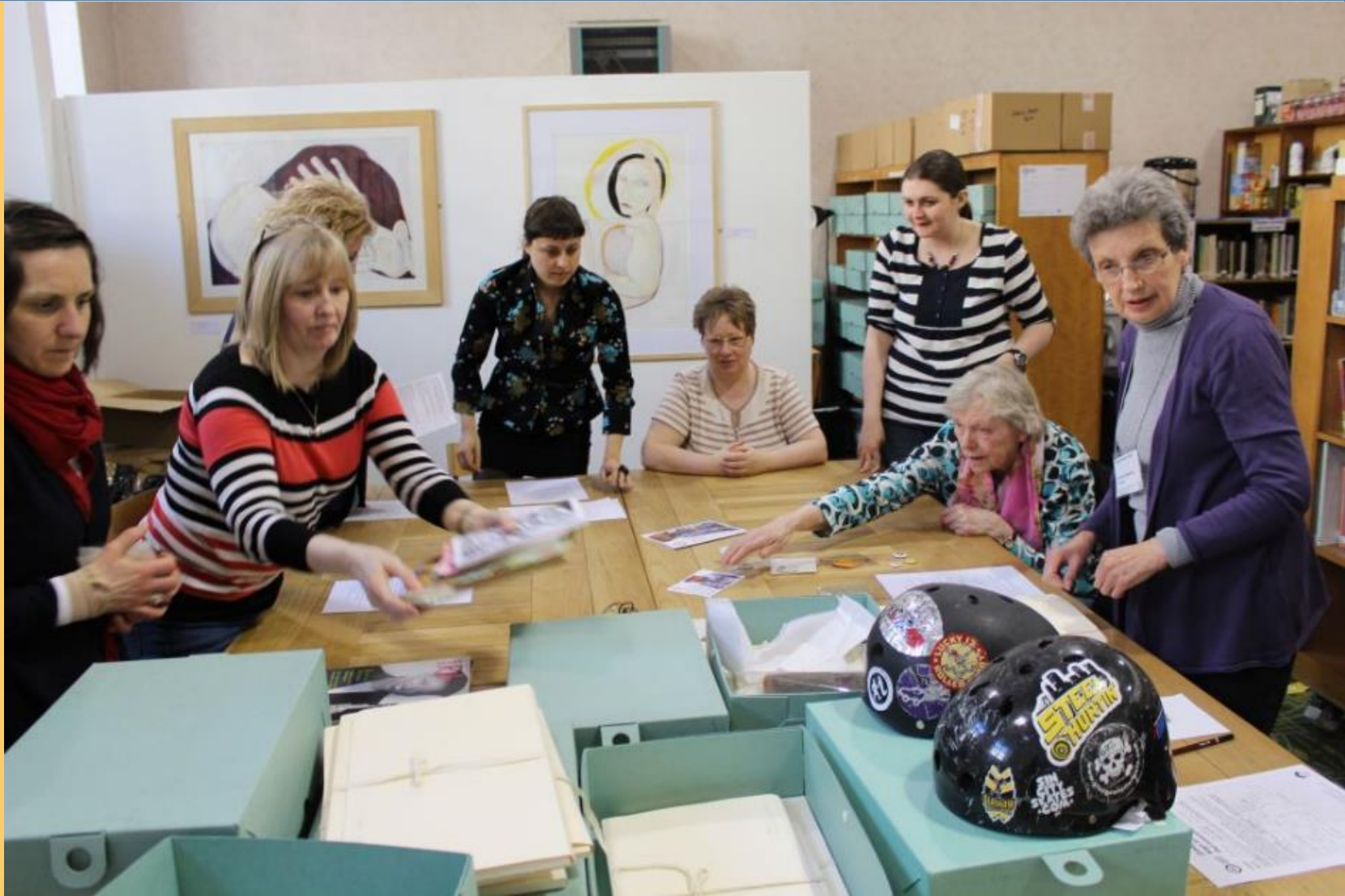
Glasgow Women's Library archive and museum community curators working with the National Museum of Roller Derby collection created by artist, Ellie Harrison.