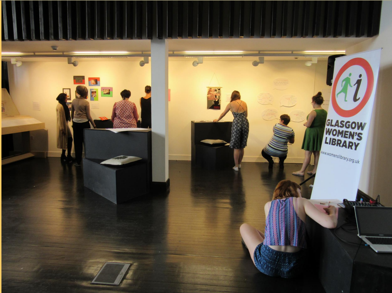
GWL Young Critics installing their first curated exhibition