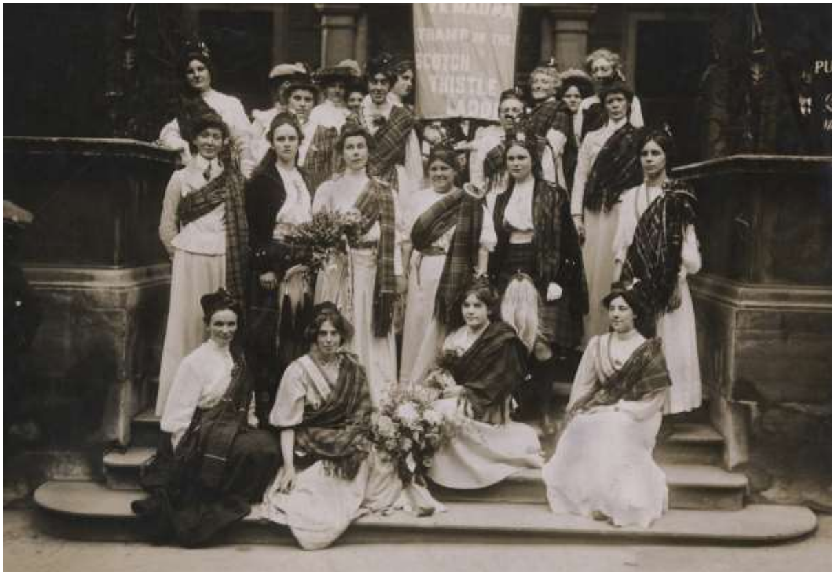
Suffragettes with Tartan Sashes, 1908

Part of PROCESSIONS by Artichoke and 14-18 NOW, a project bringing thousands of women together in creative workshops leading to UK-wide public processions on Sunday 10th June .