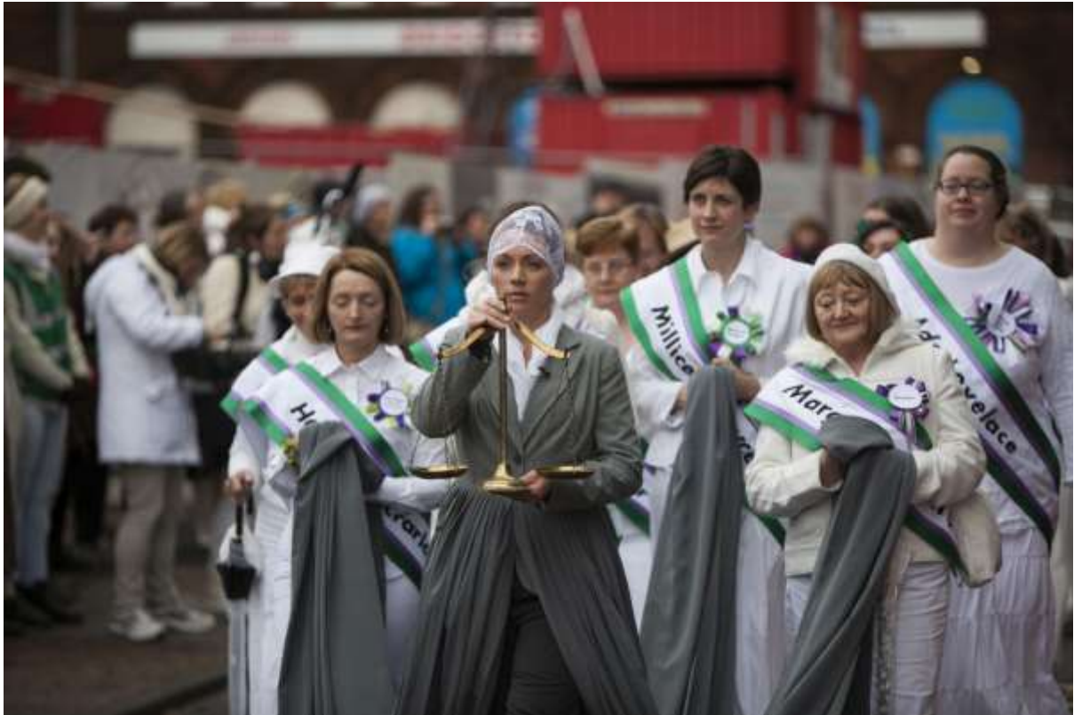
March of Women Performance, 2015

Bringing GWL's special ingredients to a place near you