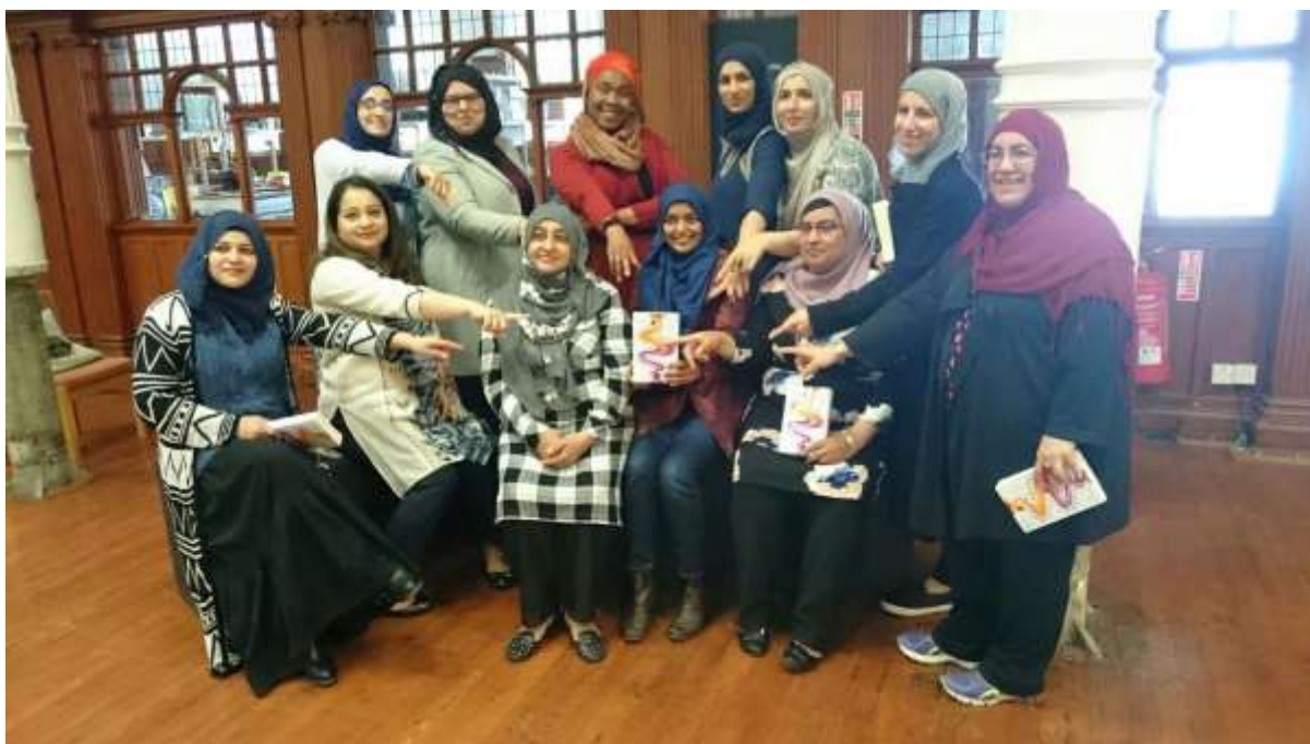
Reading Group for Muslim Women, 2017