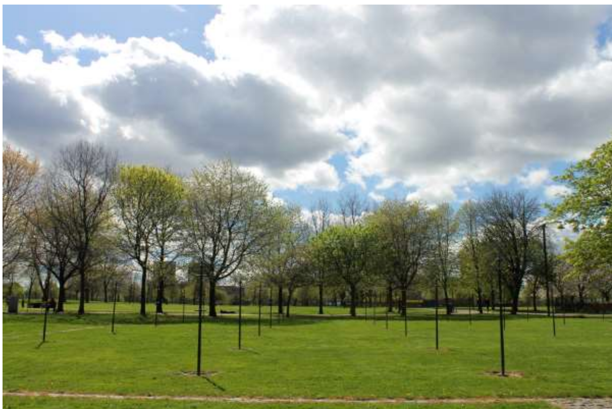
Laundry Poles on Glasgow Green