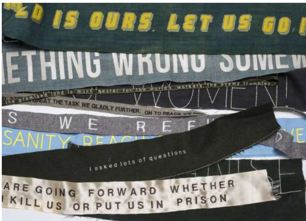
Fiona Jack 'Our Red Aunt', 2017, Credit: Fiona Jack