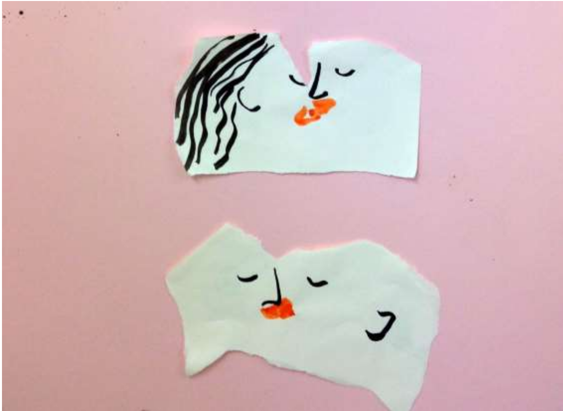
Detail from Research Drawing for 'From Glasgow Women's Library', 2017 Credit: Sally Hackett

Explore our new collection of empowering souvenirs and the inspirations behind them