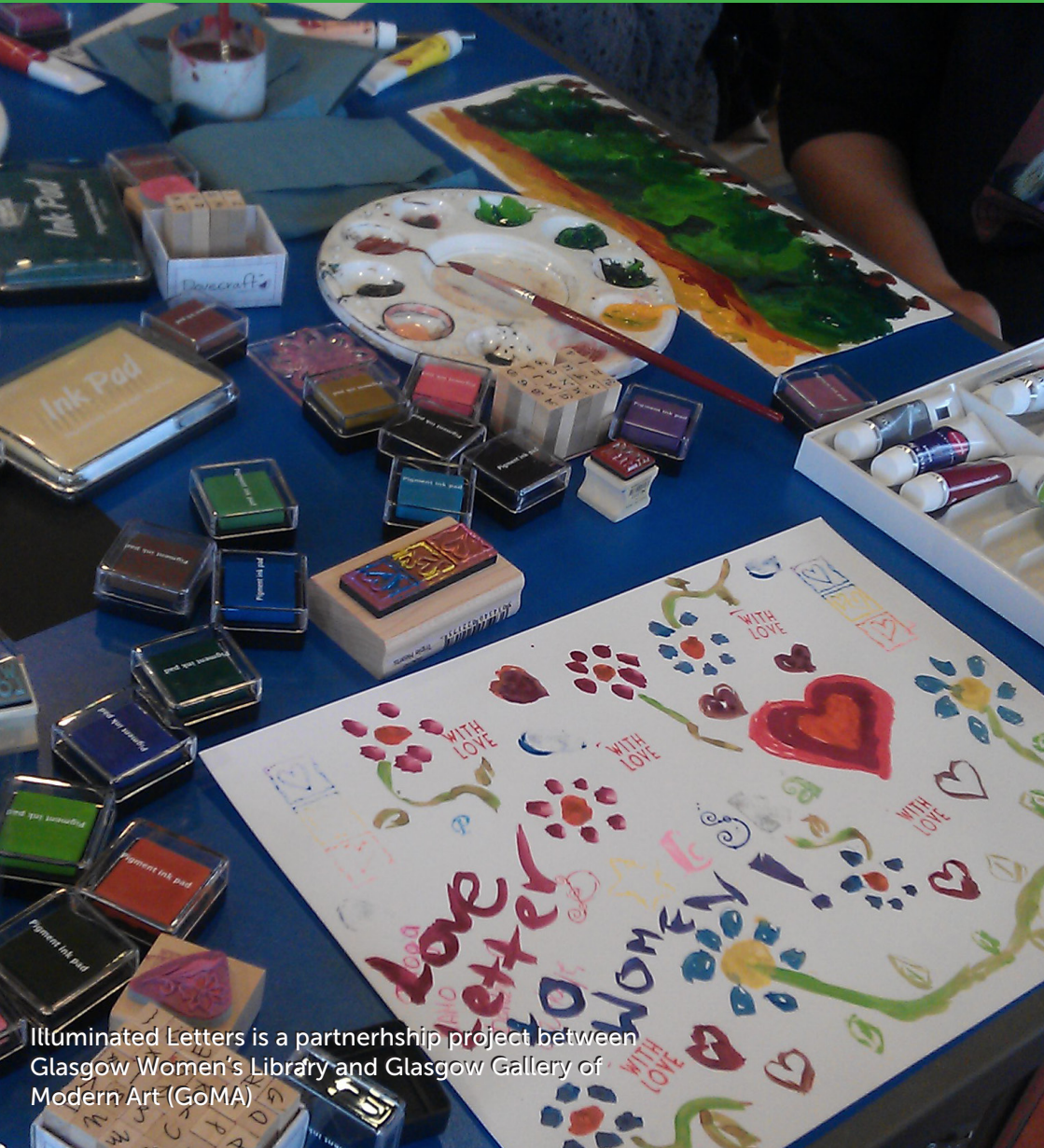
Illuminated Letters is a partnership project between Glasgow Women's Library and Glasgow Gallery of Modern Art (GoMA)

Illustrated letters of love & honour to heroines in our shelves and boxes