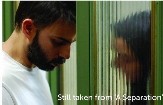
Still taken from 'A Separation'

helpless at the hands of fate. One of these women has everything to fight for. One of them has nothing to lose. (Hindi with English subtitles).