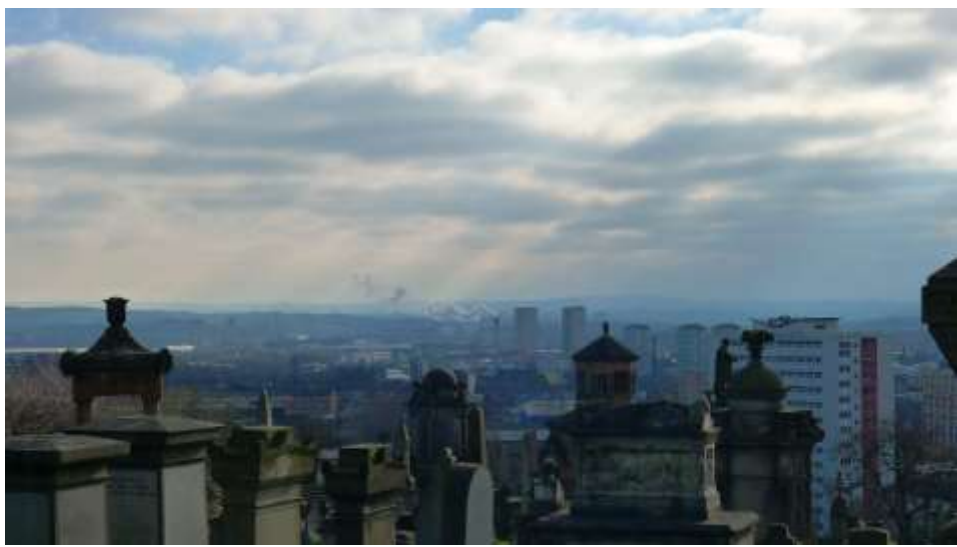
Necropolis Women's Heritage Walk

A rich array of ways to discover the hidden histories of women