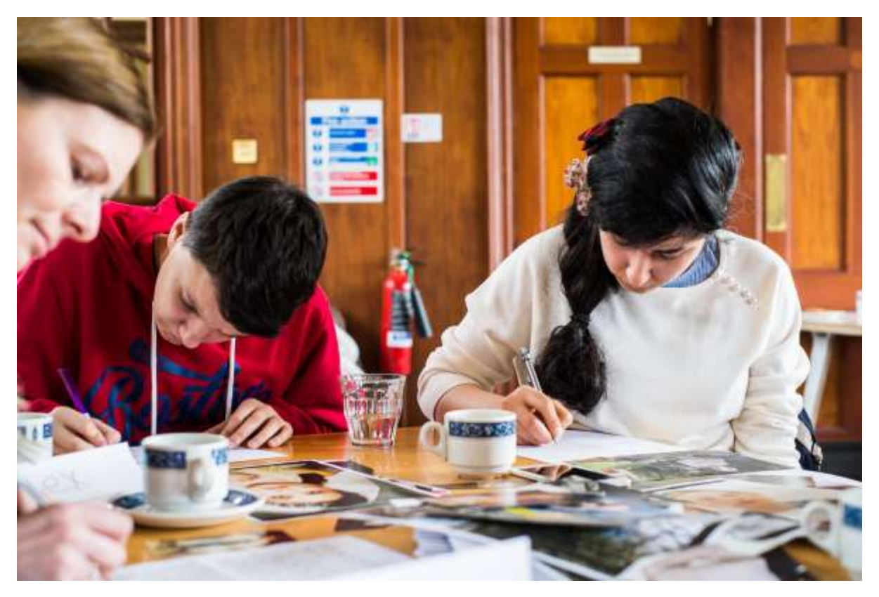
Creative Writing for Fearties Credit: Katy Owen