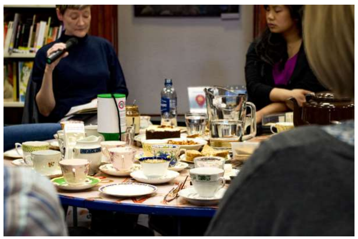
Story Café

the globe, whilst helping us to make sense of our own. So why not top up your cuppa from our big, bottomless teapot, get yourself comfy and be a part of the story.