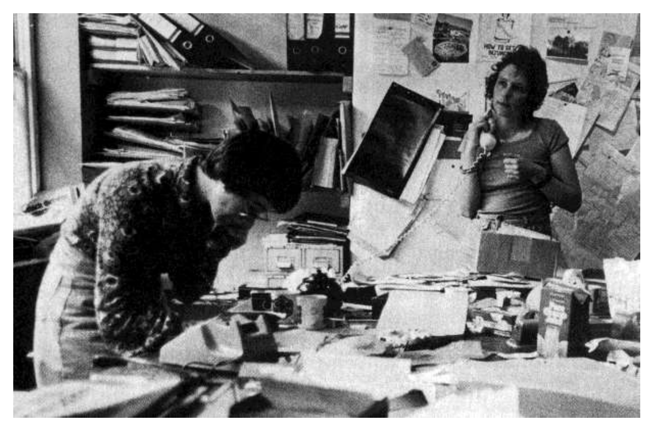
Women's Aid Office