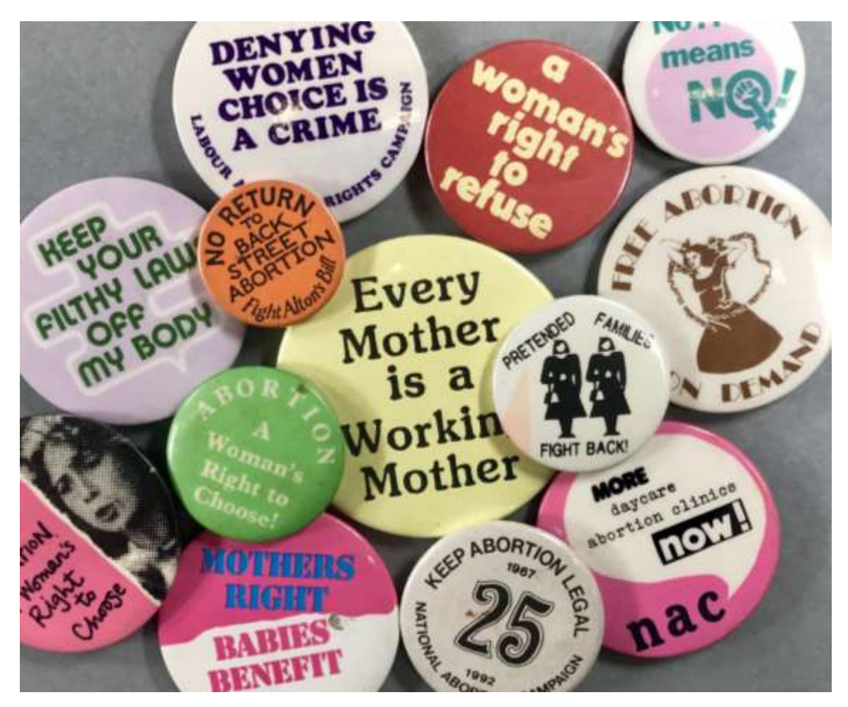
Reproductive Rights Badges from GWL