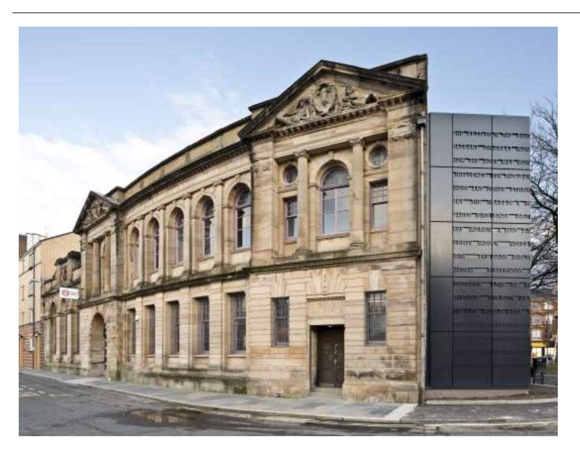
GWL building

To book on to any of our Women's Heritage Walks please visit our website at womenslibrary.org.uk , come in to see us at 23 Landressy Street , or call us on 0141 550 2267 for more information. We cannot take payment on the day so all bookings to be made in advance. Further details of where to meet will be provided once booking is confirmed.