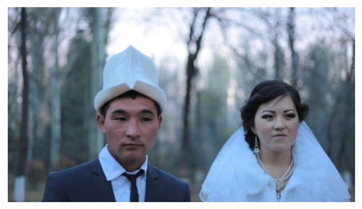
Grab and Run, Film Still