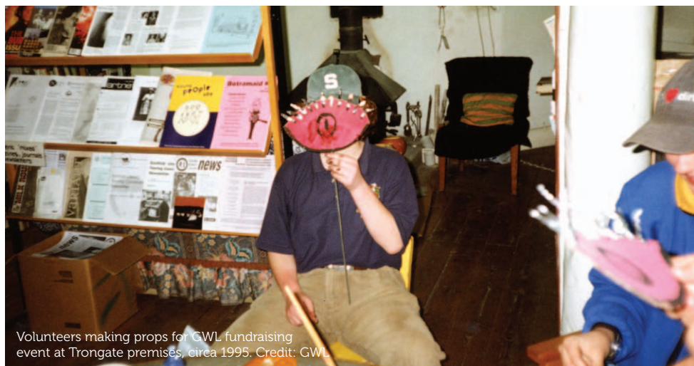
Volunteers making props for GWL fundraising event at Trongate premises, circa 1995.