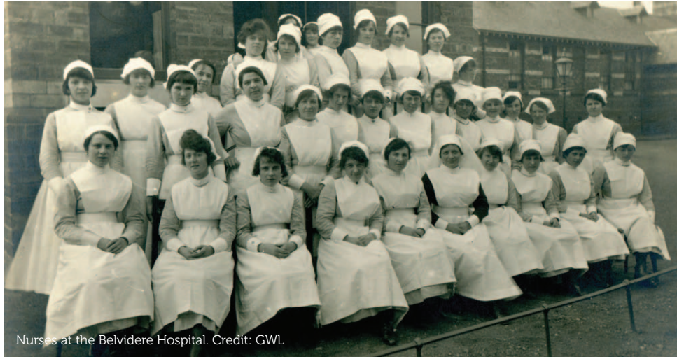
Nurses at the Belvidere Hospital.