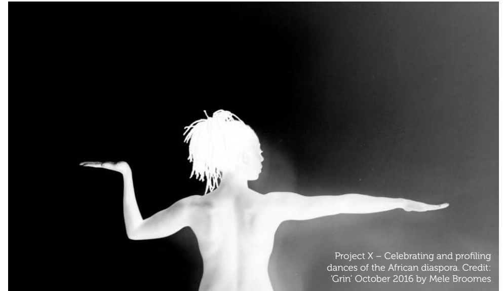
Project X – Celebrating and profiling dances of the African diaspora. Credit: 'Grin' October 2016 by Mele Broomes