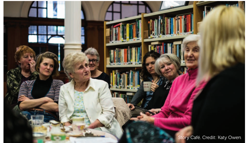
Story Café.