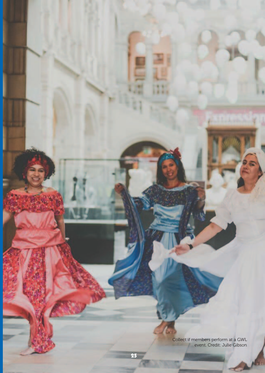
Collect:if members perform at a GWL event.

For more information or to book onto any of these events contact the Library on 0141 550 2267 , email us at info@womenslibrary.org.uk or visit womenslibrary.org.uk