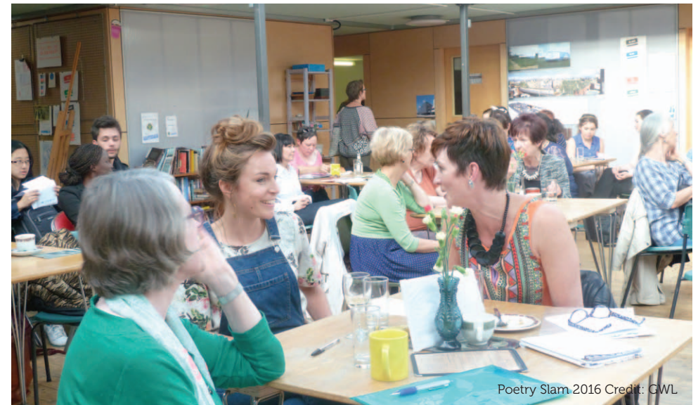
Poetry Slam 2016

Prior booking for these popular events are essential as tickets sell fast. For more information or to book onto any of these events contact the Library on 0141 550 2267, email us at info@womenslibrary.org.uk or visit womenslibrary.org.uk