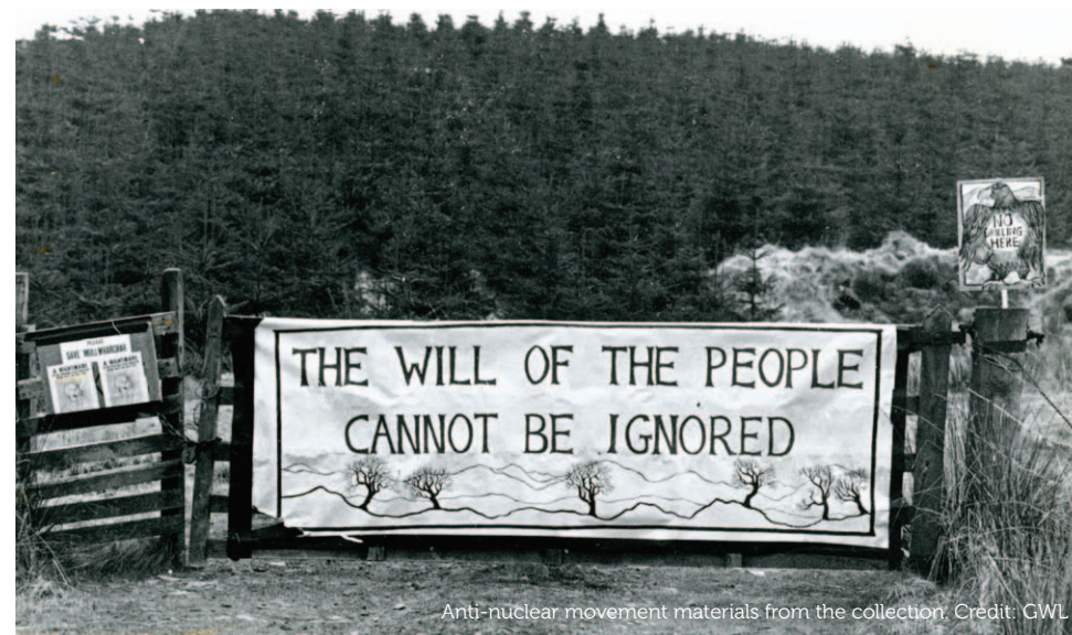
Anti-nuclear movement materials from the collection.

For more information or to book onto any of these events contact the Library on 0141 550 2267 , email us at info@womenslibrary.org.uk or visit womenslibrary.org.uk