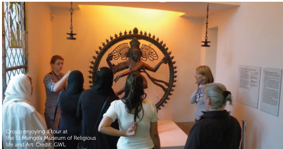
Group enjoying a tour at the St Mungo's Museum of Religious Life and Art.