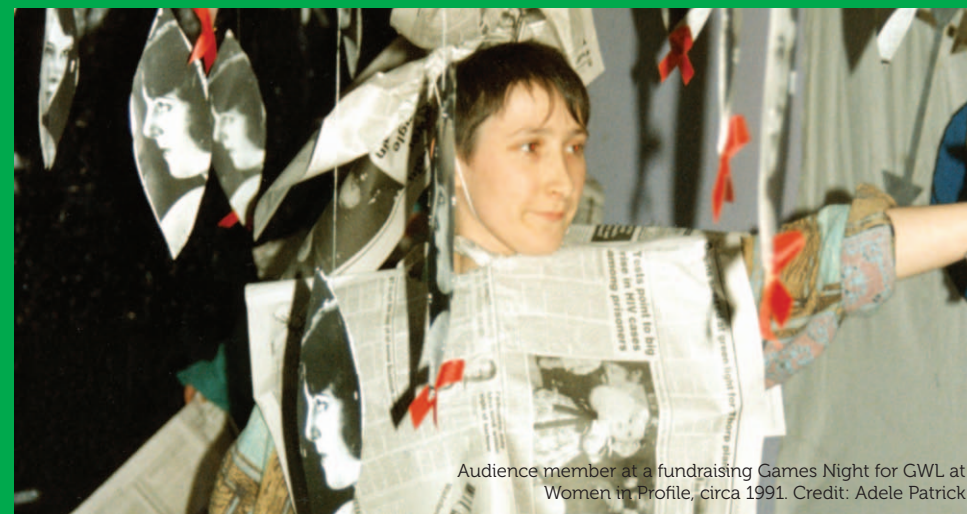
Audience member at a fundraising Games Night for GWL at Women in Profile, circa 1991.

This is the final programme of our 25th anniversary year, and what a year: awards galore, the library popping with excitement and creativity and with optimism abounding. Bigger picture planning and reflection has also been the flavour of the past few months for the team. We are full of anticipation as we look to the future and delivering even more in better ways for everyone who uses GWL.