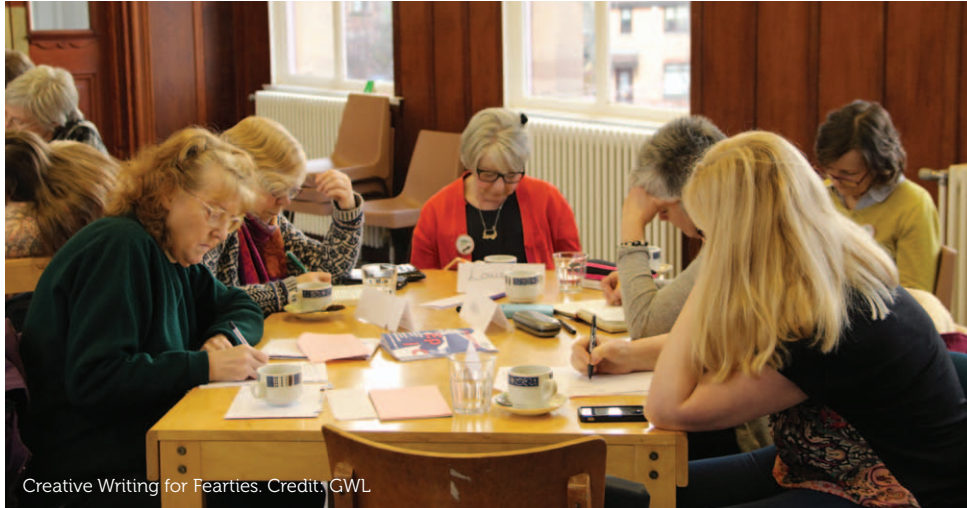
Creative Writing for Fearties. Credit: GWL