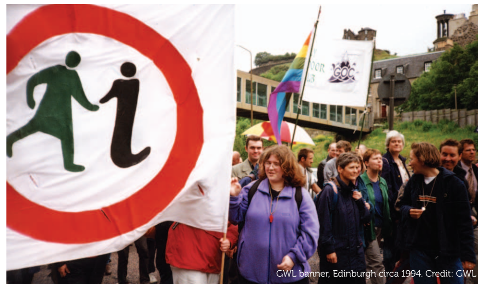
GWL banner, Edinburgh circa 1994.