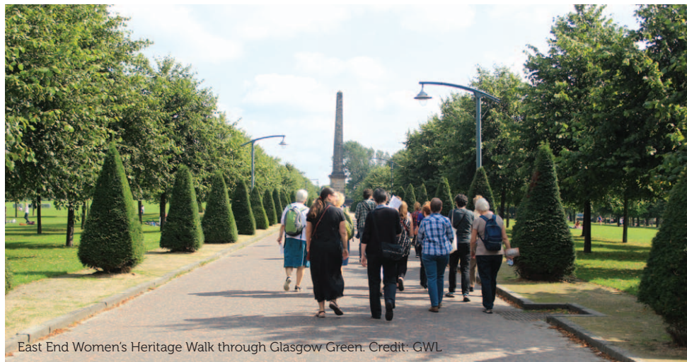
East End Women's Heritage Walk through Glasgow Green.