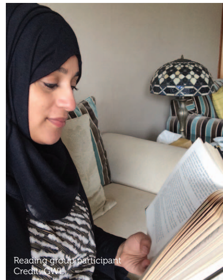
Reading group participant