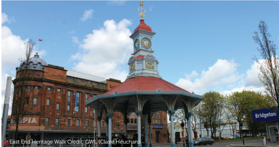
East End Heritage Walk