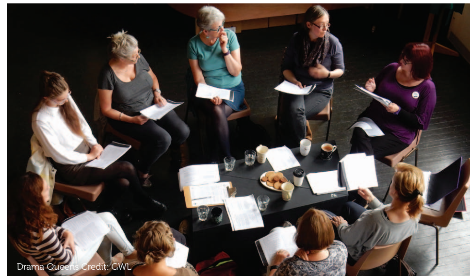
Drama Queens

For more information or to book onto any of these events contact the Library on 0141 550 2267 , email us at info@womenslibrary.org.uk or visit womenslibrary.org.uk