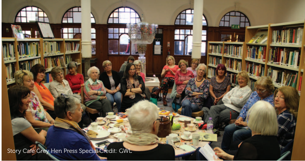
Story Café Grey Hen Press Special.