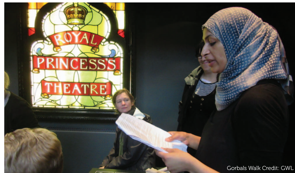
Gorbals Walk

For more information or to book onto any of these events contact the Library on 0141 550 2267, email us at info@womenslibrary.org.uk or visit womenslibrary.org.uk