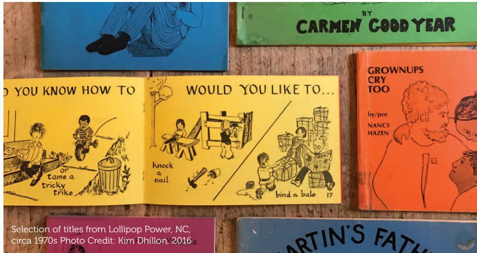
Selection of titles from Lollipop Power, NC, circa 1970s