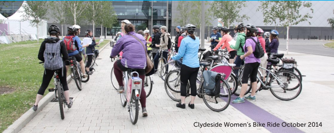
Clydeside Women's Bike Ride October 2014

Workshops & activities exploring the hidden histories of Glasgow's women