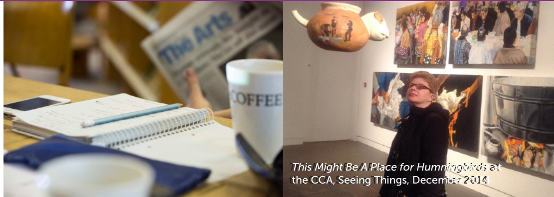
This Might Be A Place for Hummingbirds at the CCA, Seeing Things, December 2014