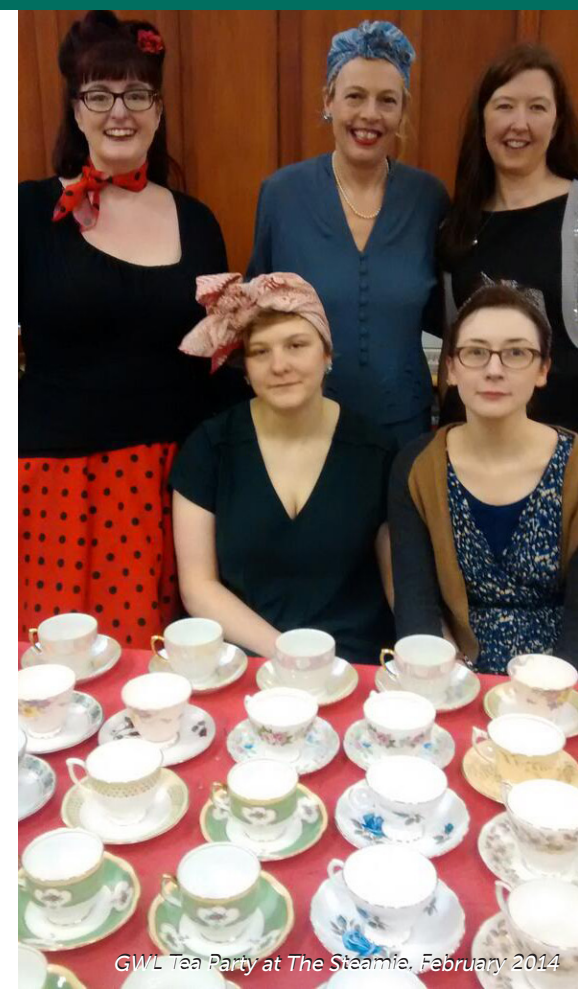
GWL Tea Party at The Steamie, February 2014