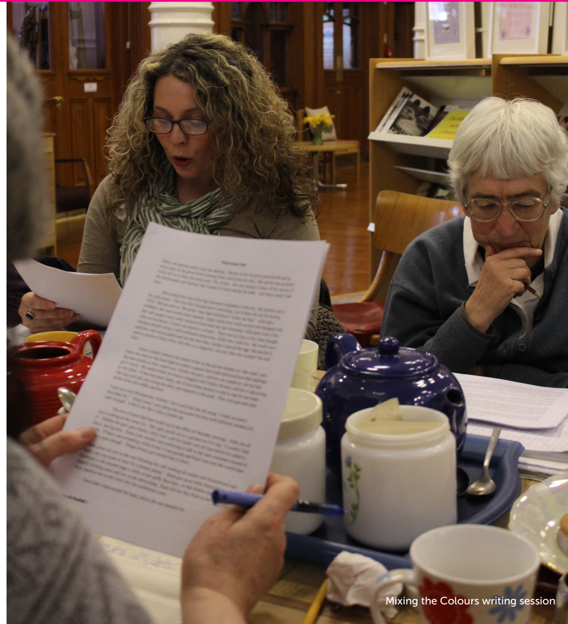
Mixing the Colours writing session

This event is for those who have participated, partnered and funded the Mixing The Colours project. Please see the Mixing The Colours pages for more information at womenslibrary.org.uk