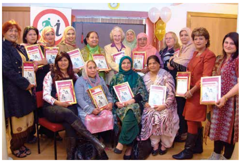
The launch of 'She Settles in the Shields.'

Other popular projects this year focussed on intergenerational work, including supporting teachers and pupils at Glendale Primary School to organise workshops around the topic of 'Asia' and the development of a project involving students at Bellahouston Academy looking at attitudes to Domestic Abuse in various cultures. In collaboration with