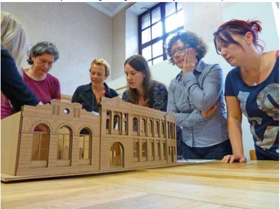
The team plan the stunning new Glasgow Women's Library with our Architects, Collective Architecture