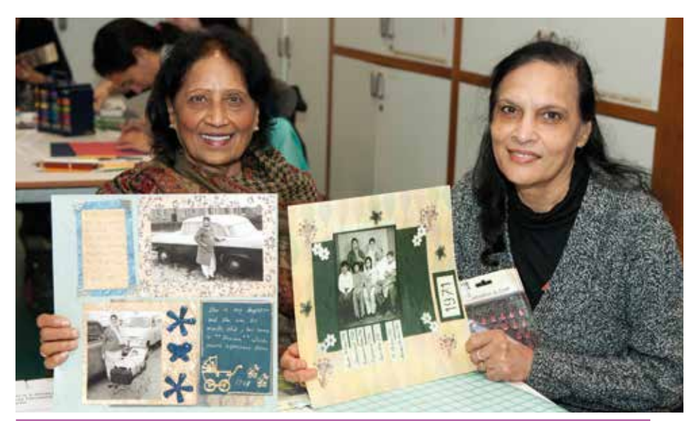
"['Lifebooks'] is a good way to look back on the positive things I have done in my life. The staff encouraged us to develop ourselves. I thought I wouldn't like to make a book about myself but I loved it!"

This year we were proud to launch our exciting new publication, 'She Settles in the Shields: Untold Stories of Migrant Women in Pollokshields'. This book is the culmination of two years work involving the gathering of testimonies and oral histories from over forty women who share intimate feelings of moving to a foreign land in search of family, love and security, into a climate and culture very different to their own. Told in their own words, the women reveal a fascinating story of hope, isolation, warm welcomes, cold weather, racism and the quest for acceptance and integration. We hope this project, which also involved the creation of a touring exhibition, will promote a better understanding of the personal struggles, successes and achievements of the migrant women who chose to settle here, as well as contributing to developing cohesion within the diverse communities of our nation. The exhibition has been widely shown in venues all over Scotland and the publication is available to borrow from all Glasgow City Libraries, where it is proving very popular, and is also available to buy from GWL and from the GWL website through our online shop.