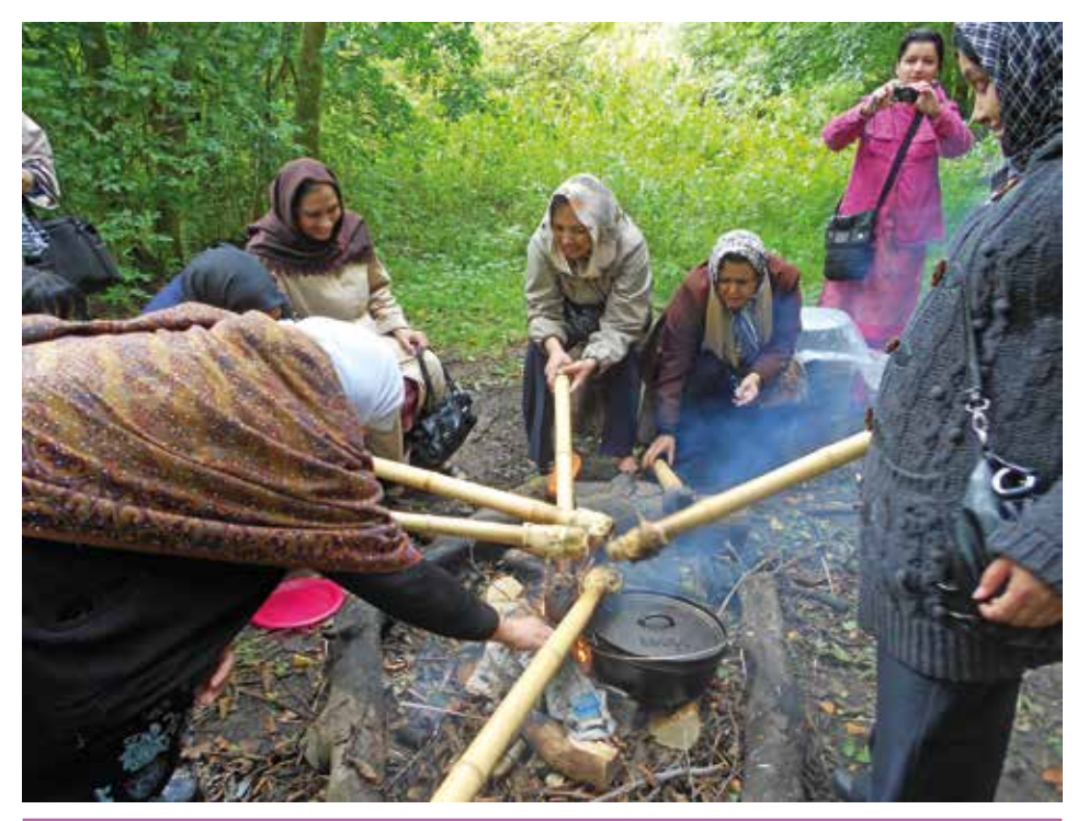
"It was great to meet women from different backgrounds; the session was a good way to learn in the outdoor setting, nice fresh air and great company; I learnt about how some migrant women cooked in the outdoor in their home country." 'Living Classrooms' participant

the Castlemilk Domestic Abuse Project we worked with a range of community groups in the South of Glasgow to create a series of posters to raise awareness of violence against women. These powerful portrayals raise important issues such as the blaming attitudes that society often has on women and, crucially, demonstrate